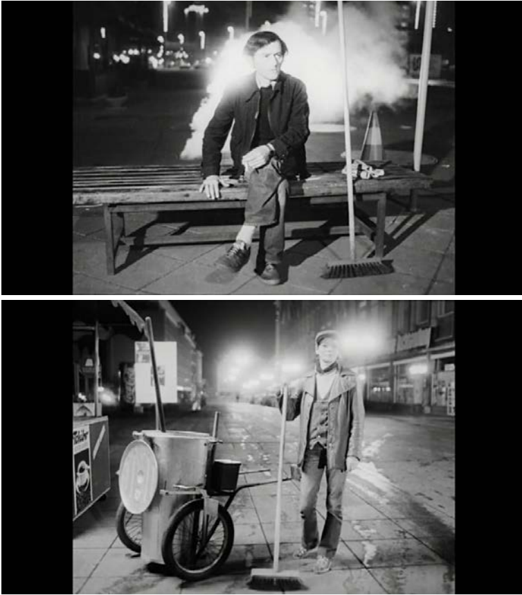
Figs 1, 2: Observant bystanders.

Here, the frame does not simply channel a reality that is already in place, it participates actively in selecting, weighing, and composing its consistency. Judith Butler explores a related epistemological paradigm in her investigation of images of war. She argues that the waging of war takes place through frames of war: '[t]he frame does not simply exhibit reality, but actively participates in a strategy of containment, selectively producing and enforcing what will count as reality.' [21] The frame, in other words, plays a role in how reality comes to be recognised.