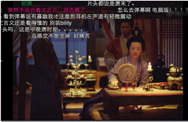
Fig. 1: Screen capture from Bilibili.com.