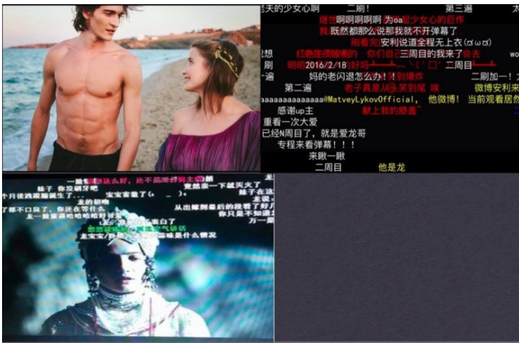
Fig. 3: Screen capture from Bilibili.com.

Danmu intertextualisation contributing to cultifying the film: the 'pseudo-synchronicity' of Danmu gives rise to the blurring of the line between imagining fictional worlds and experiencing real events, which enables viewers to have a space to convey their redefinition of the static readerly texts into fluid intertextual networks and encourages repeated attempts from the audience to participate in a rhizomatic process of creating an environment for cross-cultural cult engagement. It is evident from a considerable number of Danmu that He's a Dragon is accepted as a cult film through the repetitive viewing practices of fans.[10] Typical Danmu comments are: 'Watched it for the second time!', 'Third time', 'Specially come to see Danmu!!!'.