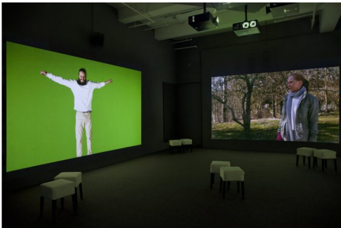
Fig. 2: Studies on the Ecology of Drama, 2014, four-channel projection installation, HD, 16:9, audio 5.0, 25:40, 30 second loop. Edition of 5 + 2AP.

Ahtila's creative commentary on filmic perspective with regard to non-human worlds recalls Anat Pick's ideas on zoomorphic cinema. Drawing on Estonian biologist Jakob von Uexküll's thoughts, Pick's essay 'Animal Life in the