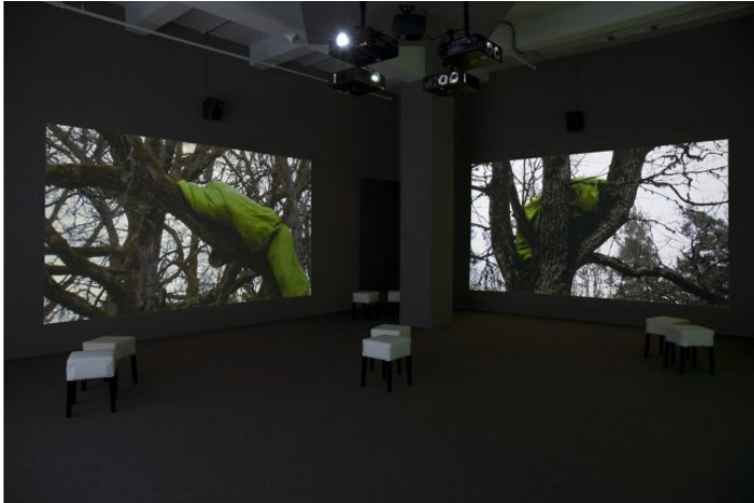
Fig. 3: Studies on the Ecology of Drama , 2014, four-channel projection installation, HD, 16:9, audio 5.0, 25:40, 30 second loop. Edition of 5 + 2AP.