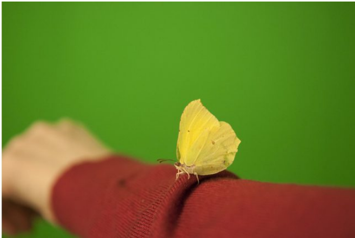
Fig. 4: Studies on the Ecology of Drama , 2014, four-channel projection installation, HD, 16:9, audio 5.0, 25:40, 30 second loop. Edition of 5 + 2AP.

Without directly relying on Uexküll's proposition that various types of human and nonhuman animals have different perceptual worlds, Studies on the Ecology of Drama comments on the limits of spectatorship in human-centric narrative cinema, inviting the gallery visitor to pay attention to specific perceptual worlds of non-human subjects, and to think about the possibility of