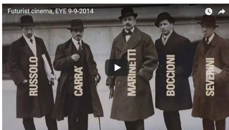
Video-documentation of the program 'Futurist Cinema'.