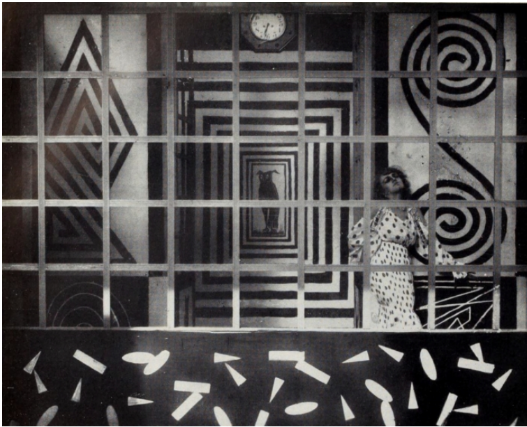
Fig. 1: Still from Thaïs by Anton Giulio Bragaglia.

On 9 September 2014, EYE inaugurated the third edition of E* Cinema, with a film program on Futurism, a movement that encompassed different art forms, although only marginally film. A compilation program, developed in collaboration with film and media scholar Wanda Strauven , author of Marinetti e il cinema: tra attrazione e sperimentazione , aimed at illustrating the historical context of this Italian artistic movement. It included films and fragments – mostly from the EYE collection – conceived in the 1910s and related to the Futurist ideas or later productions inspired by the same poetics. Those were Le Due Innamorate di Cretinetti (1911), a vaudeville comedy, a genre appreciated by the Futurists; a recording of the early car tests on the roof of the Fiat factory (1925); Conversation with Boxing Gloves by Rosane Chamecki, Andrea Lerner, and Phil Hardera (2010), a reinterpretation of a segment from Vita Futurista (1916); La marche des machines (1928) by Eugène Deslaw , glorifying factory machines and modernity; Combat de boxe by Charles Dekeukeleire (1927), a film rich in visual and editing experiments to enhance the speed and violence of a box fight. The program concluded with the Dutch premiere of the only Futurist film that survived: Thaïs by Anton Giulio Bragaglia (1917), with live musical accompaniment by the Dutch musician and performer Professor Russolo , whose stage name was inspired by the futurist Luigi Russolo .