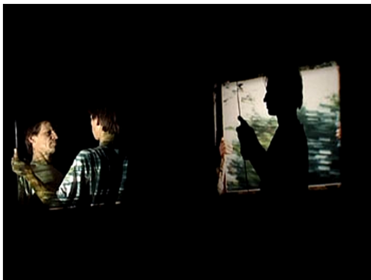
Fig. 2: Still from Guy Sherwin's performance Man with Mirror .

E*Cinema Academy is [...] a meeting place for anyone interested in film as an art form. One half of the series follows a historical path, with highlights from the avant-garde, as well as films made by visual artists. The other half is curated by art academies and universities that are responding to the current interests and needs of film as an audiovisual art form. There is no venue in the Netherlands that screens the canon of experimental film on a regular basis, yet EYE is able to fill this void, thanks to its extensive private collection and its partnerships with other international film archives. Each programme will begin with a lecture, music, or short performance, and will be followed by a discussion.