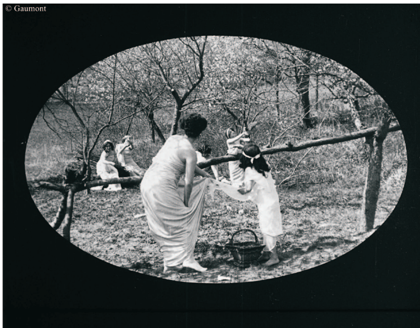
Figure 8. L'Éventail animé (Émile Cohl, F 1909).