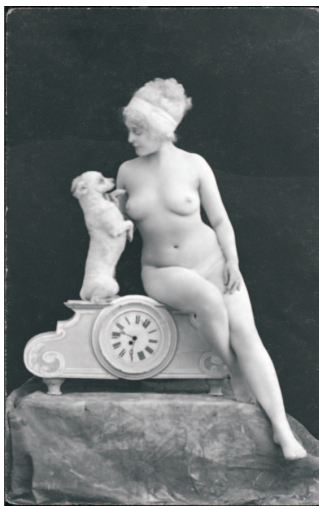
Figure 2. Full page advertisement for the tableaux vivants group 3 Olympier in Das Programm no. 182 (1905)