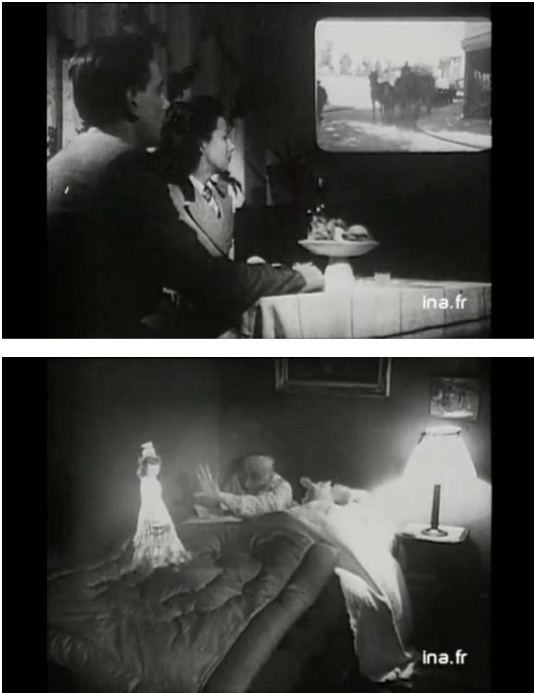
Fig. 2, 3

For Raymond-Millet as well as for Barjavel, the future (or futurist) media environment is first and foremost characterised by media convergence and the permeability of different devices, practices, and industries. In Barjavel's text, the metaphor of merging rivers, as well as the associated semantic field ('junction', 'alliance', 'synthesis') highlight processes of mixing, mash-up, and commingling, that find expression in Raymond-Millet's multiplatform television existing in close interdependence with other media forms and uses.