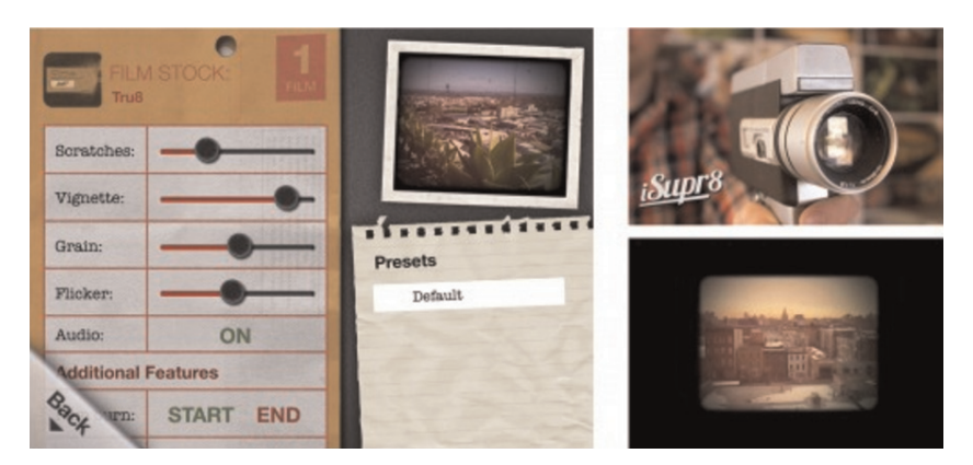
Fig. 3: Screenshots of the iSupr8 app.