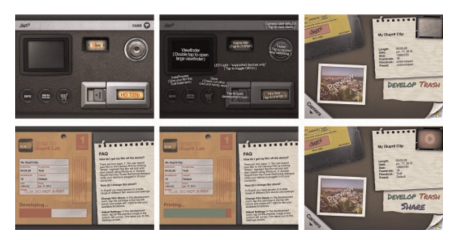
Fig. 4: Screenshots of iSupr8 app interfaces and film development process.