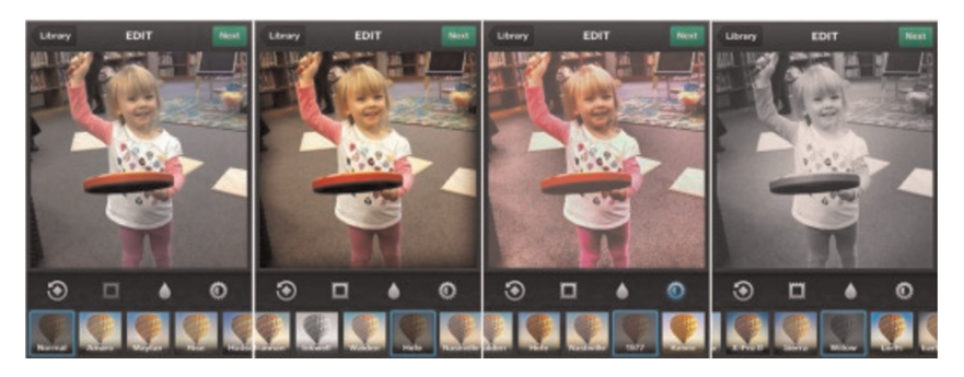
Fig 1: Examples of Instagram filters.

Interestingly, digital applications such as the aforementioned photo and video apps seem to respond to this by trying to remediate the look and feel of past media technologies in their own design and functionality.<sup>15</sup> Perhaps the most popular example today is Instagram, a mobile phone application, online photo sharing, and social networking tool first launched in 2010. It allows users to apply instant filters to the pictures taken, e.g. to make the image resemble a Polaroid photo from the 1970s. A wide variety of filters, including Earlybird, Nashville, Sierra, and 1977 can be selected by the user to adjust the image to the preferred old look.