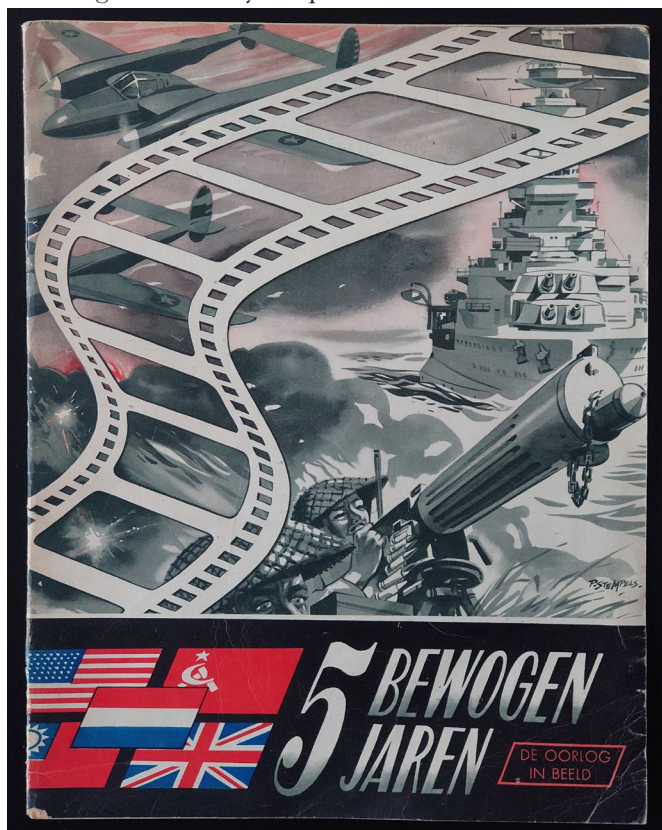
Figure 1. 5 bewogen jaren (ill. by P. Stempels, De Geïllustreerde Pers , 1945), a popular account of WWII in the Netherlands