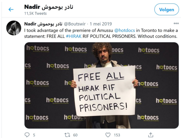
Figure 4. Screenshot of Nadir Bouhmouch's Twitter account with a post on his presence at Hot Docs, Toronto.

terms of political causes with regard to queer, feminist, postcolonial, migrant, poor, and ecocinema. 60 Some young filmmakers today, such as Nadir Bouhmouch, director of AMUSSU (2019), a documentary about residents from a Moroccan village resisting a silver mine, explicitly see their work as Third Cinema, and favour collectivist and participatory methods of production instead of becoming absorbed in auteurism. 61 Bouhmouch, moreover, has also applied the idea of 'film act' in a contemporary way using the spotlights of a major film festival to make a political statement. During the premiere of AMUSSU at Hot Docs in Toronto, May 2019, he protested against the imprisonment of Hirak Rif activists in Morocco, which he subsequently communicated through Twitter as well (fig. 4).