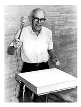
Fig. 2. Max Mathews with the Radio Baton/ Drum in 1992. Photo by Patte Wood (Chadabe 1997, p. 231)

Musical interaction which is not based on score-following techniques, but on strategies of gesture mapping, does not only behave as an "ensemble" (live performer and computer accompaniment). Some modes of musical interac-