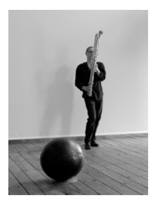
Fig. 5. par_cho|r : fugue. Performance at the International Symposium on Music, Art, and Robotics (SMARt) in Bremen (14 June 2006). Courtesy of Christoph Lischka

Christoph Lischka's project par_cho | r (2001-2004), which exists in different implementations such as par_cho | r : mono , par_cho | r : fugue (as performances) and par_cho | r : trans (as an installation), deals with sound-generat-