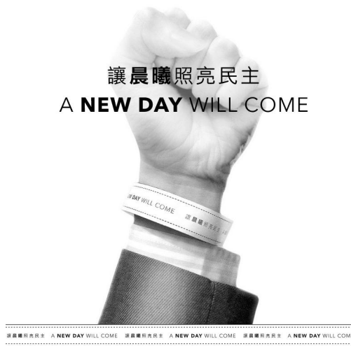
[Image 3] Symbol of the #CongressOccupied movement in Taiwan, March 2014.

before and immediately garnered the attention of Taiwanese citizens worldwide in record time.