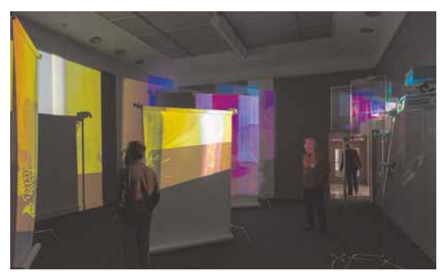
Fig. 3: 'Shunga' (2014).

here is a documentary filmmaker very much aware of the increasingly difficult status of the documentary as genre and practice, especially in the digital age, especially when poised between cinema and television on one side, and art space, museum or gallery on the other.<sup>13</sup>