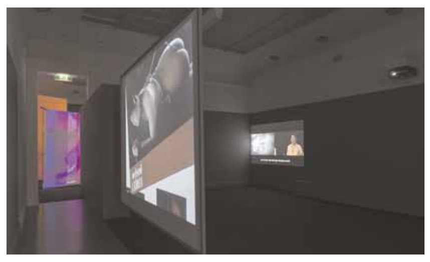
Fig. 4: 'Lovely Andrea' (2007).

becomes the prime matter for building the platform upon which the image of its death will be stored. As sizzling aluminium flows Steyerl concludes: 'matter lives on in different forms, this does not apply to humans', still reading from Tetryakov's book. More than rehabilitating a proto-object-oriented ontology, the filmmaker brings to our attention the literal shift from representation to modulation as materiality transubstantiates into image and back, eluding all physical boundaries.