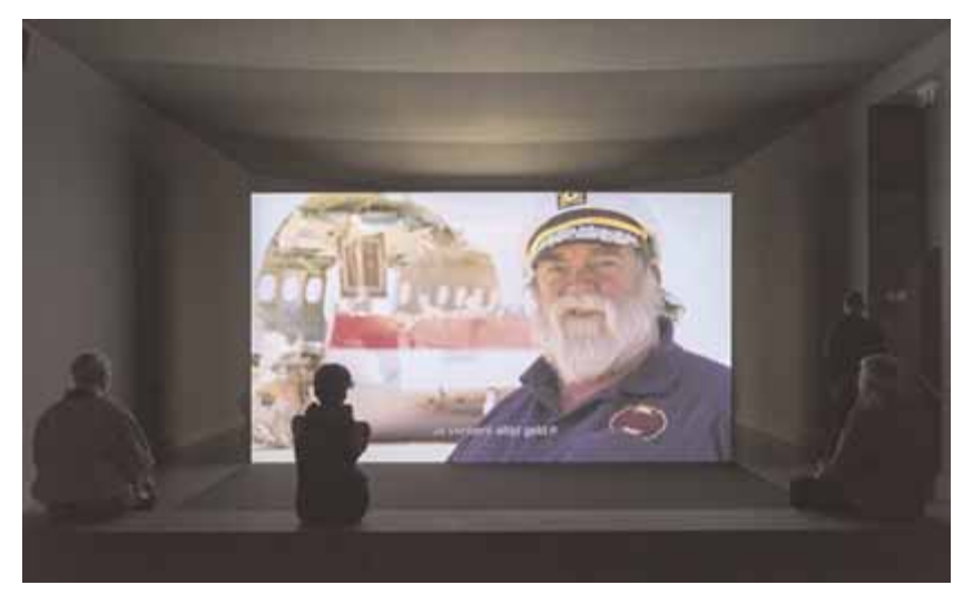
Fig. 5: 'In Free Fall' (2010).

These three experimental films show us that images have gone beyond depicting pre-existing conditions and in the process have acquired a temporal dimen-