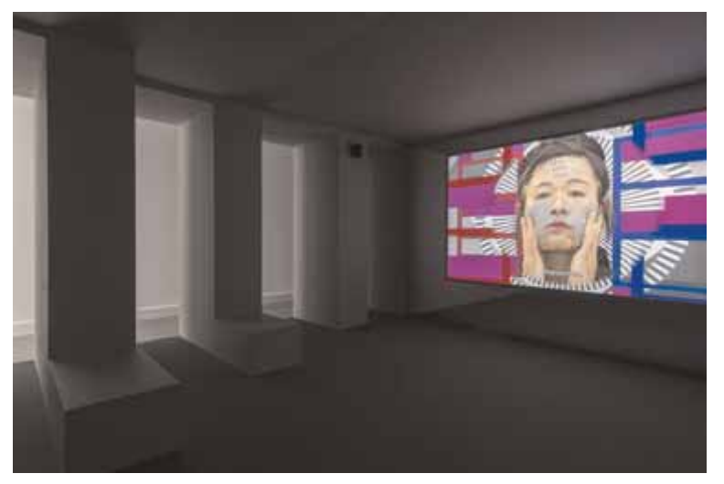
Fig. 1: 'How Not To Be Seen. A Fucking Didactic Educational .MOV File' (2013).