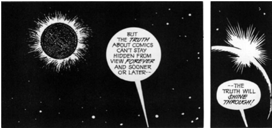
Fig. 1: The truth about comics still needs to be uncovered. Scott McCloud, Understanding Comics: The Invisible Art , New York: Harper Perennial, 1994 (1993), 211.

"The truth about comics can't stay hidden from view forever ", argues Scott McCloud in his comic book about comic books. 1 In a way, this short quotation expresses the rich, ambivalent, and fascinating history of the medium that is the comic book. The comic book has been polarising opinions for more than 120 years: some have considered it a threat to the intellectual development of the younger generation, as venomous for the reigning moral standards in society, as cheap – and morally dubious – entertainment, as escapism, or as the reason for the demise of language. Others have praised the comic book for its creativity, for its ability to put children in touch with the pleasure of reading, or for its contemporary and innovative expression. The comic book has also been a popular medium for political, ethical and economic manipulation. 2