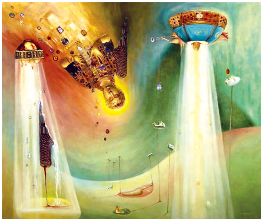
Fig. 3: Chaya Agur, Falling Angel , mixed techniques, 50 x 60 cm.

is represented by masks (the fake self that acts according to the convention of its historical time). The masks have gaping mouths, ready to swallow the wealth pouring down into them. One of them, at the front of the painting, is reaching out a hand to grab the fleeting wealth that is raining down before it. The artist criticizes here, in my opinion, the capitalistic pursuit of abundance and success within a linear time and represents it as an alienated, 'false pursuit' which distances the human being from an authentic inner search.