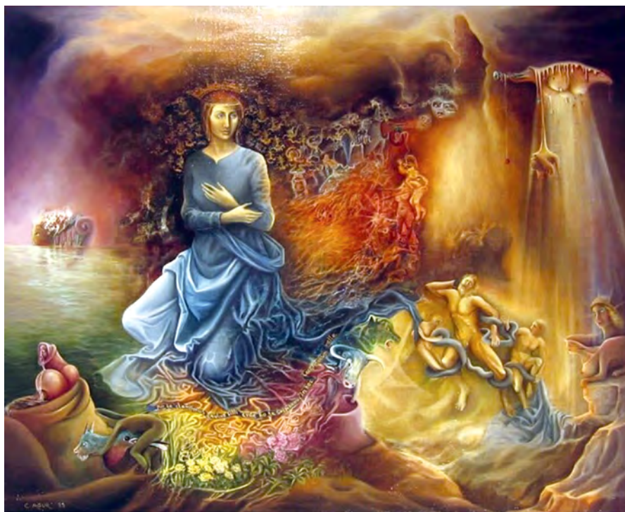
Fig. 5: Chaya Agur, The Two Madonnas , oil on canvas, 60 x 50 cm.

to mystical simultaneous time – to observation from the “divine” viewpoint. It is possible nowadays to see or experience the whole world simultaneously, thanks to an immense capacity of memory, which is not unlike the complete memory that is possible on the level of a higher power such as God. 59 The creation of a virtual environment can also be likened to world creation. 60 A virtual reality is not necessarily similar to everyday reality. The virtual world can be very different from the real world, even in its most fundamental principles. Such an environment takes us back to the dream time characteristic of surrealist art. The dream does not follow the laws of reality or of any particular style – every artist has their own personal, subjective environment.