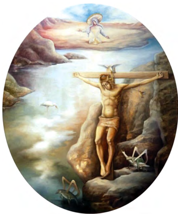
Fig. 2: Chaya Agur, Crossing Nature , oil on canvas, 40 x 50 cm.

er's symbolic world which amplify the paradox of time within existence: the lyre bird is the eternal soul being raped (at Jesus's feet) by a lizard-like creature which symbolizes a connection to the earth. Inside the water, we see the hybrid creature born from this coupling – a lizard with lyre wings hesitantly walking on stilts.