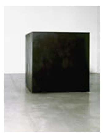
Fig. 3. Smith, Tony. Die , (1962/1968). Steel, 72 x 72 x 72.

But, just as the science fiction robot has crises that shatter its illusions and bring it to life, so, too, does the computer. The robot only ever approaches full humanity, perhaps at the final threshold of being, the awareness of its own inadequacy, its own lack of being. So it goes with the computer. It is a tool that approaches the complete externalization of human agency, and our worst fear, perhaps, is that it might forget it is an externalization of our agency. In forgetting that it is a tool, in becoming intelligent, in the leap from tool to tool maker, it completes its mirror image of human consciousness. In other words, when the computer forgets the essence and purpose which we have imposed upon it, it effectively escapes our grasp. But, what, ultimately might such a move say about us? What if the anxiety over its forgetting is also the anxiety of our own re-membering and an end of our fantasy of freedom.