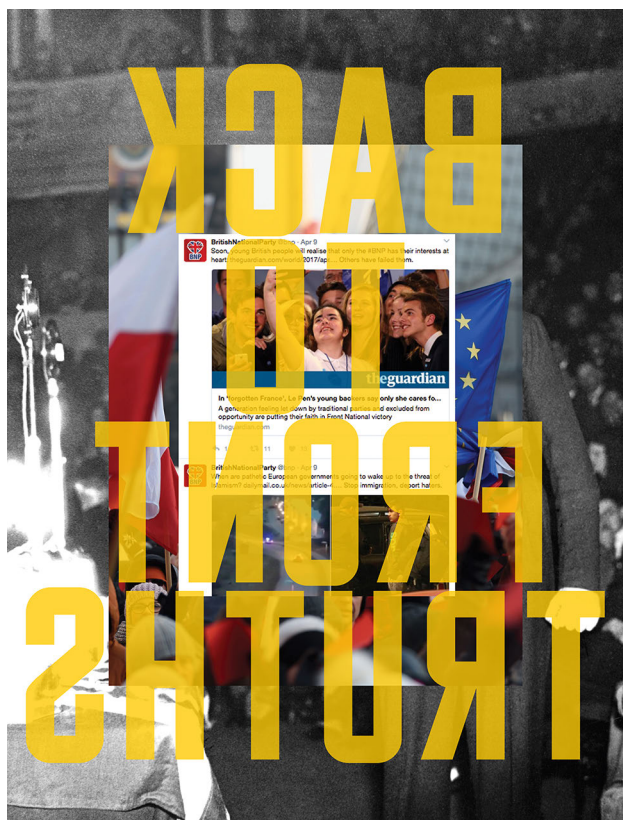
Montaged poster poem (English version) from Nick Thurston, Hate Library (2017).