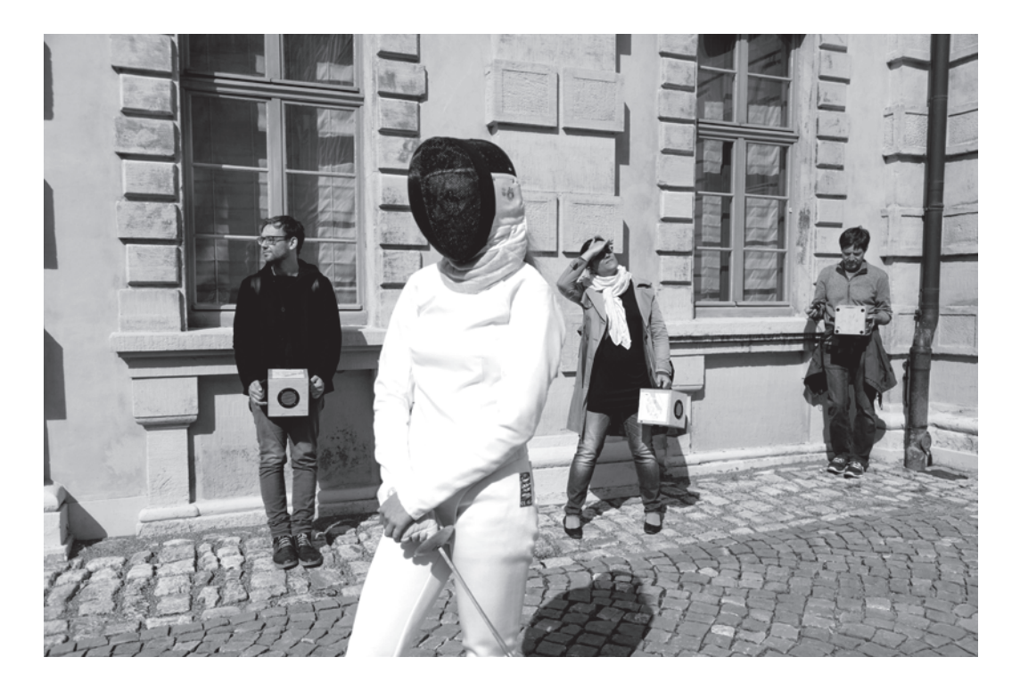
Figure 2. Phantom Synchron – Soundtrack Weimar.

Starting from a central meeting point, an audience of 10-40 people is equipped with »sound boxes« consisting of a built-in MP3-player and loudspeakers. At the beginning of each performance, the production team synchronizes the MP3-players, with each device playing back one voice in a multichannel acoustic composition.