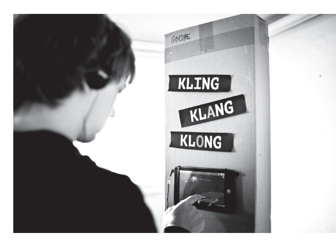
Figure 3. KlingKlangKlong. Credits: Martin Christopher Welker for Playpublik. License: Creative Commons (CC BY-NC 2.0).

mixed reality, a concept that was realized in early locative games.<sup>50</sup> The commonly created soundtrack is the primary medium of communication between the players. Musical structures may temporarily arise through synchronized movements or be destroyed by any player's intervention.