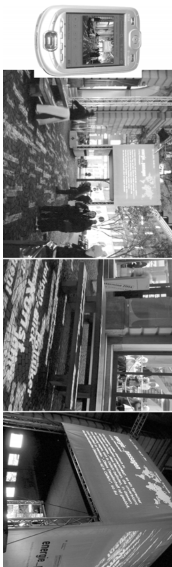
Fig. 3. Energie-Passagen – interactive installation in public space (2004)

mation” in November 2004 in front of the “Literaturhaus” in Munich. Visitors could choose definitions on-site and “interpose” them into the flow. In this way text movements are set into motion, which allow connections between the definitions to emerge. The definition network creates new meanings, which differentiate themselves from the original linear texts. Computer voices react directly to the intervention of the visitor and accompany him or her as multi-voiced echo. In addition, a world map visualises the journey, which then takes the chosen definition through the geographic landscape of the news. The visible result of the visitors’ preferred words is the “Living Newspaper”. Its dynamically generated choice is projected within their original sentence onto the “information cube”. The deconstruction of the newspaper, which results from the fragmentation of its original contents, leads to an unaccustomed reading and understanding. The artificial voices of the flow invite the discovery of new sense correlations. The spectators find themselves in an aura of speech and luminous symbols. It creates an atmosphere of liveness between audience and place that allows immersion (consumption) as well as reflexion (evaluation).