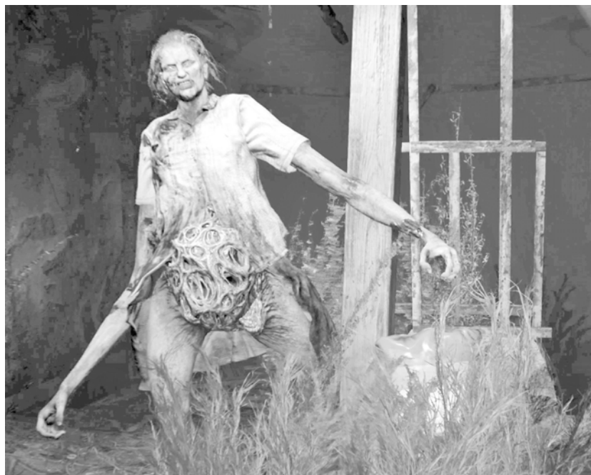
Fig. 3: Marguerite's mutated form and insectile vulva