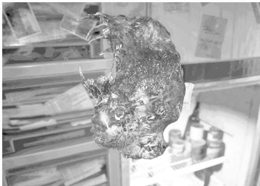
Fig. 2: The Deputy's head

In Mia's flashback, we see that Molded are also produced by Eveline, specifically from a substance that she vomits. The association with illness and contagion is obvious: vomiting is a common sign of both infections and toxins. We see the transmission in a cut-scene when Alan, Mia's partner, repeatedly vomits a black substance as his wrist heart-rate monitor shows he is dying. This grotesque death has Mia crouching down and focusing on Alan; from this angle we see nothing