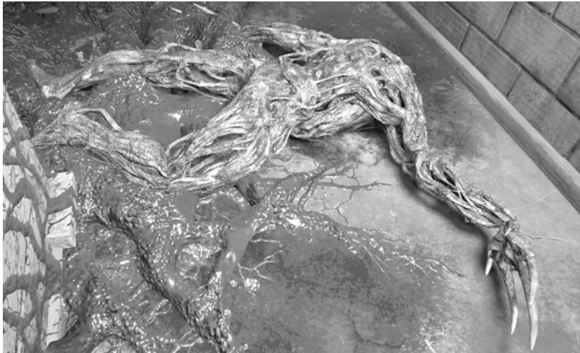
Fig. 1: The structure of the Molded body (headless)

Molds are a type of fungus that grow in elaborate networks of microscopic filaments called hyphae. These hyphae weave together to create thin, fuzzy patches or thick, branching root-like structures. Hyphae secrete digestive enzymes to break down the substrates they grow on, absorbing nutrients to enable further growth. Some molds are parasitic, growing and feeding on living organisms without killing them, but most are saprophytes: decomposers that do not attack living things. While in the minority of known mold species, toxin-producing molds are common in many environments and can consume almost any nutrient-rich substrate (Coppock and Jacobson 2009, 637). A wide variety of fungi are capable of producing mycotoxins and many produce several different toxins that can have varying effects. The Bakers' buildings, water damaged and showing initial infestation in the basement, take on the standard environment of infection. As molds decompose dead matter, they metabolically generate heat and release moisture from the material breaking down. This moisture and heat are ideal for further mold growth, creating