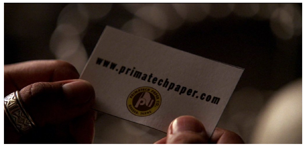
Fig. 1: Screenshot of business card close up from Heroes S01E12 (»Godsend«)

(see fig. 1). At this point of the TV narrative, the audience already knows the name of Bennet's company—the only reason for this invitational close-up is for people to go online and try out the web address. This is even more evident given that we never see Mohinder actually visit the homepage. Christy Dena understands this scene as a "catalytic allusion", which "can have two functions: they can simply operate normally as part of the non-interactive discourse, or they can succeed in being recognised and acted upon as a catalyst for action" (DENA 2009: 310). Assuming the allusion worked and the audience followed the invitation, they found a homepage that let them browse through company information, etc. It was very reduced in style as well as information and the design looked outdated for 2007.