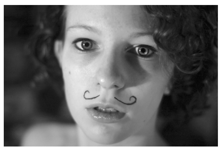
Figure 2: topupthetea: non pas!

Let us therefore consider a representative photograph by the author "topupthetea" which bears the title "non pas!": The image is, first of all, a selfportrait of the photographer in landscape format, taken possibly by her own hand from an elevated angle. The cropping shows her face from the middle of the forehead to the chin. Due to the low depth of field (on closer examination, digitally generated using a filter), only a small portion of her nose is truly sharp; due to the camera angle, her visible uncovered shoulders melt into the background blur. The coloring of the image includes dark reddish-brown tones that harmonize well with her curly red-hair. The pictured Flickr user has plucked eyebrows, the viewer can see green eyes with large pupils in the middle; her face has light freckles. Her eyelashes are blackened with mascara and her eyes are framed by a discreet eye liner. On the slightly parted lips, behind which one can see a glimpse of her teeth, a subtle red lip gloss is applied. Last but not least, on her upper lip, a thin handlebar mustache drawn with kohl can be seen, which seems at first glance to cause a disruption in the construction of femininity.