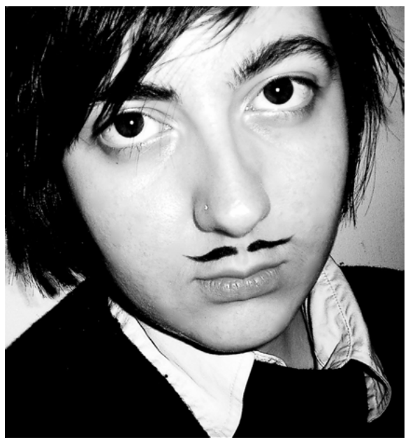
Figure 4: ksen: drag – pleased

While a feminine appearance is still in the foreground in the previously discussed category, the women of the final category are presenting themselves as men in a convincing way and thus deconstruct their assigned gender.