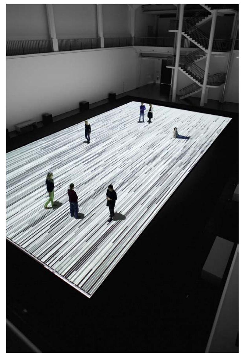
Fig. 1: the planck universe [micro], 2015. Photo: Martin Wagenhan. @ Ryoji lkeda, courtesy of ZKM \mid Karlsruhe.