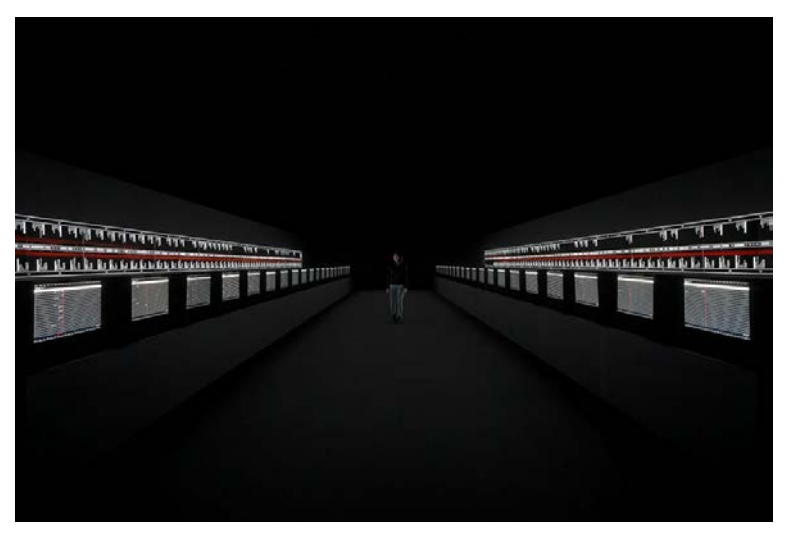
Fig. 3: superysymmetry [experience], audiovisual installation, 2014. © Ryoji lkeda, photo by Ryuichi Maruo, courtesy of Yamaguchi Center for Arts and Media [YCAM].