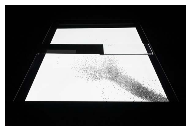
Fig. 4: supersymmetry [experiment], 2014. © Ryoji Ikeda, photo by Ryuichi Maruo, courtesy of Yamaguchi Center for Arts and Media [YCAM].

municates and shares ideas with scientists in related fields. In this respect supersymmetry , the other pairs of work presented in this exhibition, were developed during Ikeda's residency at the European Organization for Nuclear Research (CERN) from 2014 to 2015 as the winner of the 2014 Prix Ars Electronica Collide@CERN.[8]