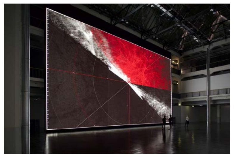
Fig. 2: the planck universe [macro], 2015. Photo: Martin Wagenhan. @ Ryoji lkeda, courtesy of ZKM | Karlsruhe.

Once entering into well-tuned large-scale projection pieces viewers were enveloped by the reverberating and convulsing sound enhanced by droning, repetitive sequences of short notes or noise, and high-pitched whine that were meticulously synchronised with the visual and strobe effects. In the plank universe [micro] the flickering abstract data - reticular dot clouds, barcode patterns, and data sequences, among others layered with white crosshair – in white and tinged by rainbow light at some points were floating and flying at breakneck speed and bewildering intensity on an immense rectangle on the floor. Such a data deluge escalated the viewer's visceral embodiment by the combination of visual intricacies and hypnotic sound, intermittently released by the abrupt caesurae by whiteout and beeping sound. In this way Ikeda's sonic and visual variations of massive amounts of data epitomised the complexity and the infinite vastness of the infosphere. In the case of the plank universe [macro]data in white and red resembling the stars and nebulae rotated in three-dimensional grids. The following scene in graphics of blazing planets moved at high speed and then progressively abstracted into a language of data, unveiling our conception of the system of universe, determined by the logic of digital computation.