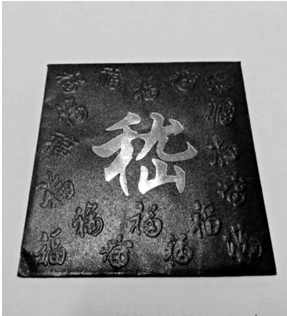
A red packet given to my nephews this year, bearing the word of my family name: Ji

When I was little, the most exciting thing about New Year was waiting for midnight on New Year's Eve when my parents took out Red Packets to give to me—inside was brand new money. However, before they gave them to me, I had to say “gong xi fa cai, hong bao na lai”, which means: “I wish you a good fortune,