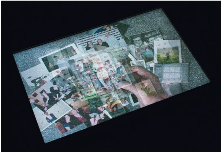
Sally Waterman, Fortune-Telling/Re-telling , 2007, Film still

Consequently, the superimposition of these childhood photographs with the playing cards and tarot reading, makes a distinction between what is known, (the past), and what is unknown, (the future), insinuating a need for a re-evaluation of the past, together with an attempt to acknowledge life's unpredictability and randomness. The pace at which the narrative unfolds, means that the audience who are unfamiliar with these photographs, are only able to quickly grasp its content, before the other two layers of the game of patience, and the tarot reading, intervene and clouds their vision. In this sense, Fortune-telling/Re-telling presents a chaotic representation, consisting of competing narratives, whereby the viewer can only apprehend what I term, 'Traces of the Self' within the family snapshots, which, in turn, become generic significations of shared human experience.