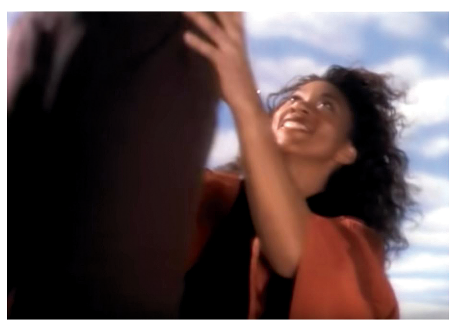
Fig. 3: Music video still from Like a Prayer, Madonna, 00:01:27.