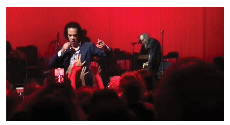
Fig. 7: Nick Cave singing and performing "Magneto" at Copenhagen, September 2017, 00:05:00.