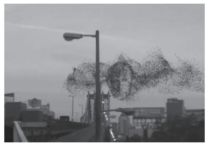
[Figure 1.3.] The shape in this flock of birds over New York appears to be the face of President Vladimir Putin.

game was successful if a machine had the same ability as a human to confuse an interrogator about its gender. But contemporary computation is not about confusion of identity but multiplication of identities. Facebook, for example, has modified the imitation game to say: if you don't want to identify as man or as woman that's fine, but please check one of these fifty-plus boxes to state your precisely defined other type of gender, and we'll make sure to send you the appropriate adds. This is not an imitation game but an identification game.