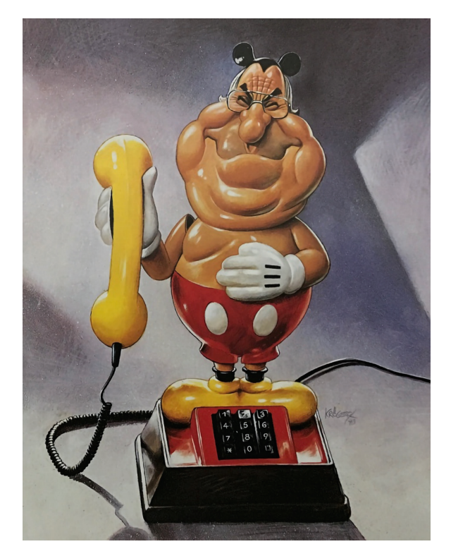
Fig. 5: Cartoon Kohl as Mickey Mouse Telephone.