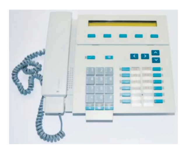
Fig. 4: Octophon 86.

The Mickey Mouse Telephone with its old technology vanished from the markets when digital networks were implemented at the end of the 1980s. A new generation of fully digital ISDN phones such as the 'Octophon 86', which offered a large number of