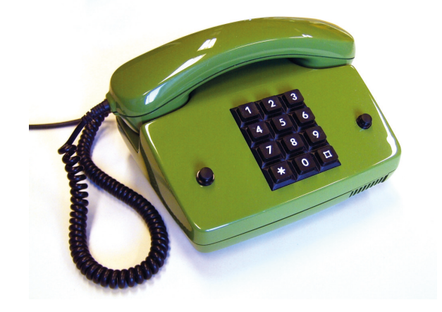
Fig.2: Fernsprechtischapparat 75.

The Bundespost organised the services and the production of all necessary equipment. Phones, cables, amplifiers etc. were produced or supplied by a strictly limited number of companies such as Siemens or Telefunken. In most cases, customers could only buy or hire their equipment from the Bundespost which at the same time formed cartels with national equipment producers. In the 1960s and 1970s, these cartels gained in strength due to an enormous increase in the number of private phone connections and a growing range of equipment. The 'Fernsprechtischapparat 75'—a standard model offered by the Deutsche Bundespost-was adopted by millions of private households nationwide. It was a symbol of uniformity and limited choice at a time when individual expression, individual lifestyles and the freedom of choice increased in importance in German society. The Keynesian understanding of the relationship between the state, the economy and society is reflected in the design of phone models in the 1970S.