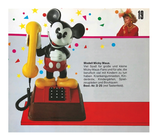
Fig. 3: Advertisement catalogue of the Bundespost in the 1980s.

Introduced by the Bundespost in June 1980, the Mickey Mouse Telephone proved to be the most important telephone within the extended offer in terms of distribution, societal significance and representation of the zeitgeist. The phone, officially named DFeAp 322 by the Bundespost, therefore embodied the tensions between the neoliberal and the Keynesian state-centred style of regulation in the telecommunication sector, the tensions within society between sociocultural norms of conformity and individualism or freedom of choice, and the tensions between the old analogue technology and the promises of digital communication.<sup>43</sup> The Mickey Mouse Telephone was an icon of 'individualistic' US culture, reflecting society's needs, desires and values in the early 1980s.44 Therefore it seemed the perfect choice for the Bundespost and the intended purpose of the series of design phones. The model was advertised as fun for young and old Mickey Mouse fans and a 'must have' for all those working professionally with children.45