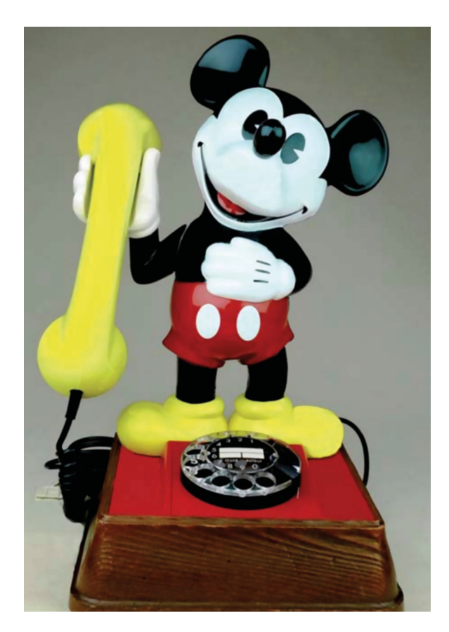
Fig. 1: Mickey Mouse Telephone.

tions. The price was several times higher than for a standard phone offered by the Bundespost.