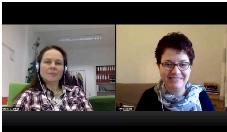
Fig. 3; available at: https://www.001.zimt.uni-siegen.de/ojs/index.php/mia/

Transformation is thus a key criterion in deciding copyright cases. This applies both to German copyright laws, which seek first and foremost to ascertain the rights of an originator, and to the Anglo-American norms of fair use (USA) and fair dealing (e.g. UK, Canada, Australia). 3 The emphasis put on the question to what extent a work is transformative raises a peculiar challenge, because, in a stark contrast to that, an academic citation is required to observe the norms of zero transformation. The different norms may be explained by the signposting of origins: in the audiovisual essay, it will be clear that the Bowie video and sound is a consistent quote. This, however, does not apply to all available material. Again, it is elucidating to consult the guidelines in the Journal of Embodied Research ; they require references both within the video and in an accompanying text document, which must include an abstract, keywords and bibliography: