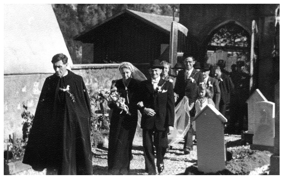
Fig. 10: Black bridal-gowns were normal in the 19th and early 20th centuries. We see here a rural wedding in Grisons, Switzerland, from the 1940s. The pastor walks in front, followed by the bride and groom with a flower girl, and then the guests. Private collection: Höpflinger.

We have observed in relation to the categorization of the private and the public that the media play a crucial role, and their role is also vital for the interaction of tradition and innovation. Traditions are formed through media communication, but at the same time media can make innovation possible, sometimes even defining something as innovative although it is not as novel as people might think. Again the white wedding dress is a good example: after Queen Victoria's wedding, fashion magazines (popular culture media) began to promote white bride-dresses, but it would be another 100 years before the white wedding gown was accepted all over Europe and in the USA. Today TV series, films, or the internet tell their consumers that the coloured or black wedding dress is innovative, and yet it was common up until the 20th century.