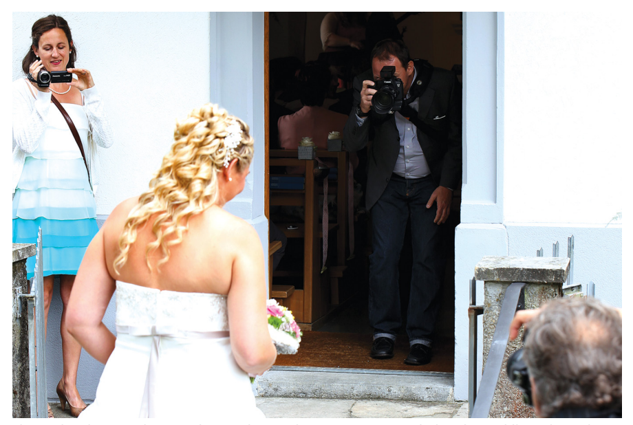
Fig. 2: The photographers need to catch every important moment during the wedding. Picture by Yves Müller, Zurich 2017.

pher, is founded on the desire to make this day unforgettable, even though for more than half the protagonists the contracts they seal come to an end before "death do them part".