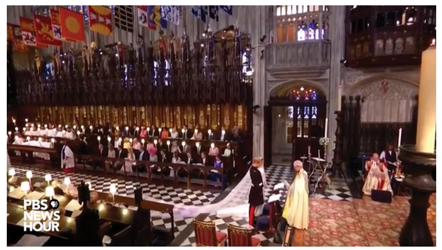
Fig. 12: The religious setting of the royal wedding (PBS, News Hour, 21 May 2018, 00:47:18).<sup>20</sup>