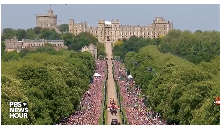
Fig. 1: Longshot from the air shows spectators lining the streets to celebrate the just-married couple.

On 19 May 2018 the royal wedding of Prince Harry and Meghan Markle flooded the television channels. Millions of spectators around the globe watched the event on screens and more than 100,000 people lined the streets of Windsor, England, to see the newly wed couple (fig.1).<sup>2</sup>