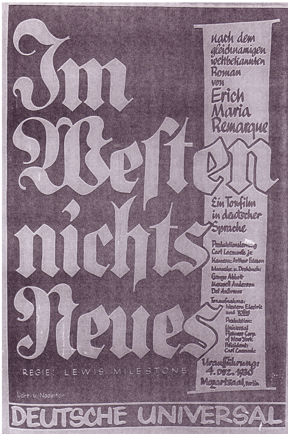
Fig. 3. Advertisement for the dubbed German version of All Quiet on the Western Front ( Der Kinematograph , No. 279, 29 November 1930).

ical explosiveness, Universal was to realise when it wanted to release the dubbed German version of All Quiet on the Western Front – Universal's only A-picture of the season. The controversial reception of the first German version of All Quiet on the Western Front has been extensively documented and discussed in light of the rise of National Socialism and the general radicalisation of the political arena in the final years of the Weimar Republic. 41 However, less attention has been paid to the technical and aesthetic aspects strongly informing the debate. As I would like to suggest, the critical and at times almost hysterical reactions to the German version of All Quiet on the Western Front – while doubtlessly being initiated by the Nazi provocations and demonstrations against the film's first public screening – can to a certain degree be related to and interpreted as a reflection of the problem of language adaptation and the lack of a cultural acceptance of dubbing.