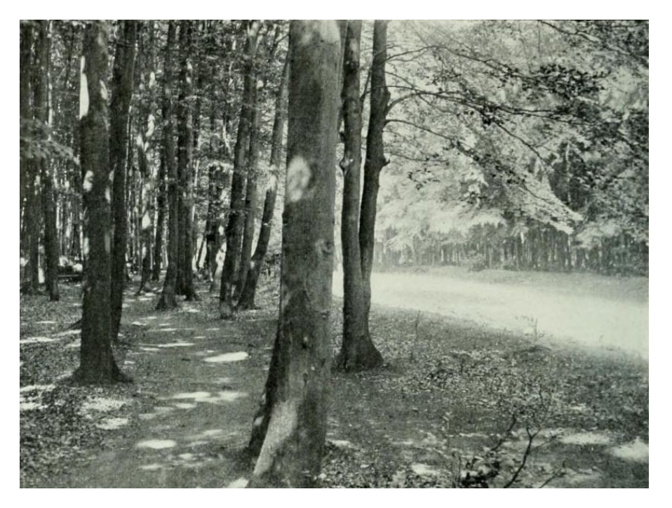
Figure 7: Sonnenflecke (nach Photographie). Scan: Salisch, Forstästhetik, 1911, p. 42.

Another example is this picture with the subtitle "Sunspots". In the foreground there are bright dots on the trunk of a tree and on the ground—accompanied by a bright, cleared area next to the cluster of trees—apparently a clearing.