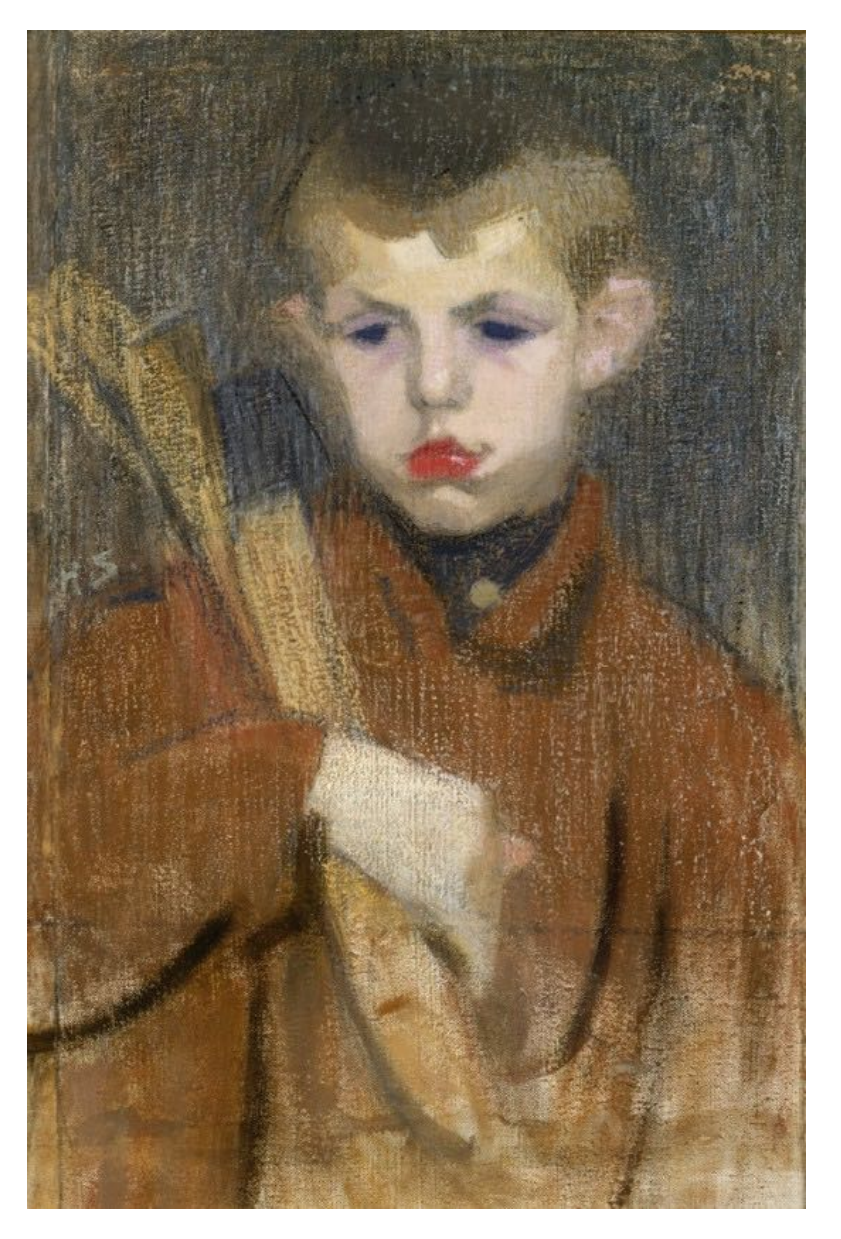
Figure 3: Helene Schjerfbeck: The Woodcutter, 1910-11. Finnish National Gallery.

There are in fact several influential artists with connections to this forestry academy, one example of which is Alvar Aalto. His designs are known to have been inspired by Finnish nature and organic shapes. Aino and Alvar Aalto's famous Savoy vase, for instance, could be compared to the form of a lake. The Evo forestry academy is located in the middle of three lakes.