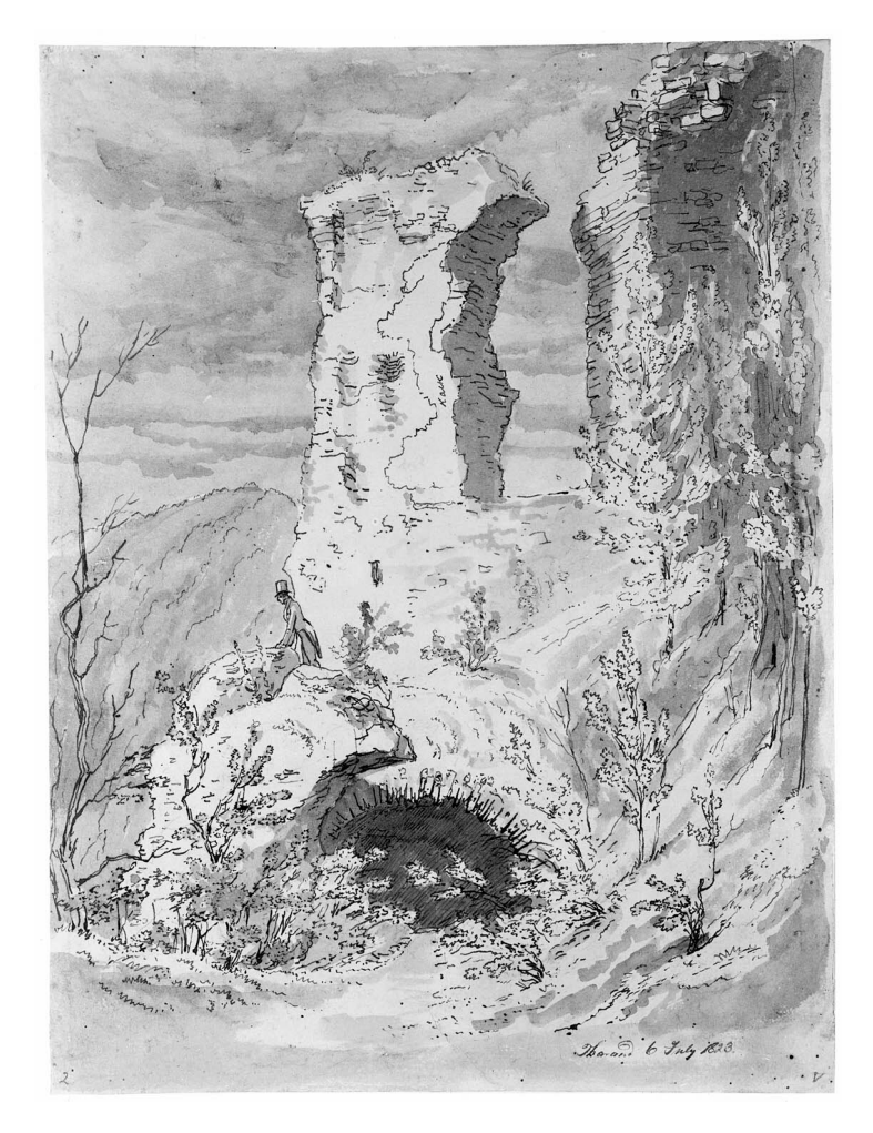
Figure 2: Carl Blechen: Burgruine Tharand bei Dresden , 1823. Kupferstichkabinett, Staatliche Museen zu Berlin.

The forestry school in Evo in Southern Finland serves as another example of the close interactions between foresters and artists. The school was founded in 1862 by Finnish foresters who were trained in Tharandt. The artist Helene Schjerfbeck was a niece of one of the forestry teachers and spent a lot of time at the school. Many of her paintings found inspiration in forestry motives.