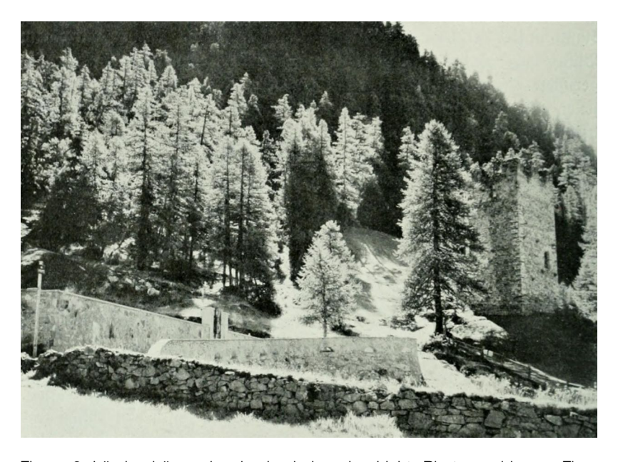
Figure 6: Lärchenbäume im durchscheinenden Licht. Photographie von Flury in Pontresina. Scan: Salisch, Forstästhetik , 1911, p. 45.

In Salisch's book there are 75 photographs of scenic views and drawings, provided by photographers and other private persons. Among the credits two women are mentioned explicitly: "Fräulein E. V. D. Planitz in Weimar" and Johanna von Salisch, Heinrich's wife. In general, changing impressions of the landscape are intended. In many pictures, the forest landscape enhances seasonal changes and variations of the daylight, as you can see on the picture "Larches with light shining through", taken in Pontresina (Southern Switzerland).