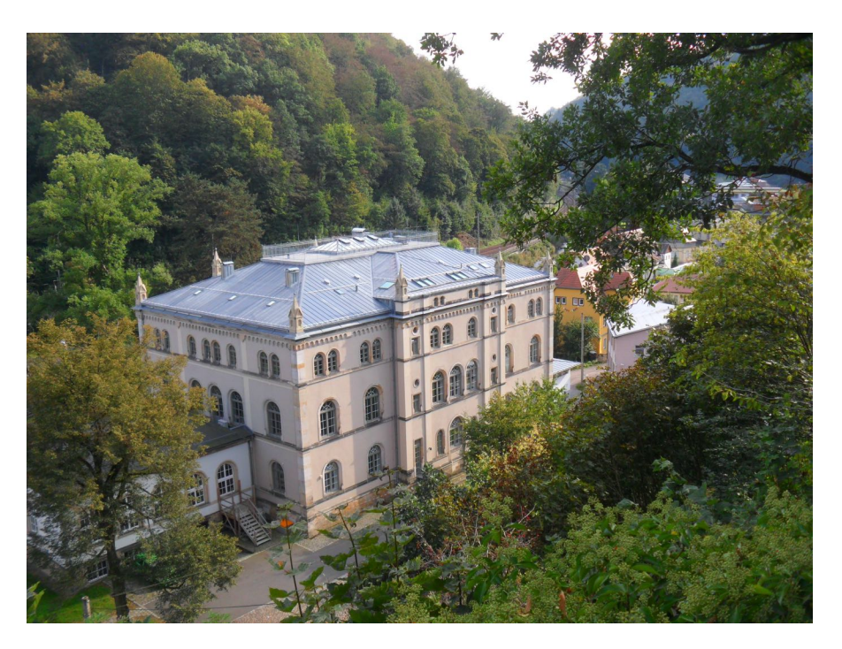
Figure 1: The Royal Saxon Academy of Forestry in Tharandt was founded in 1808. The academy building was constructed in 1847.

place in the network of academic forestry. König and other early founders of forestry schools started their education here.