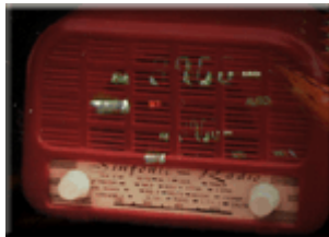
One Day on the Air