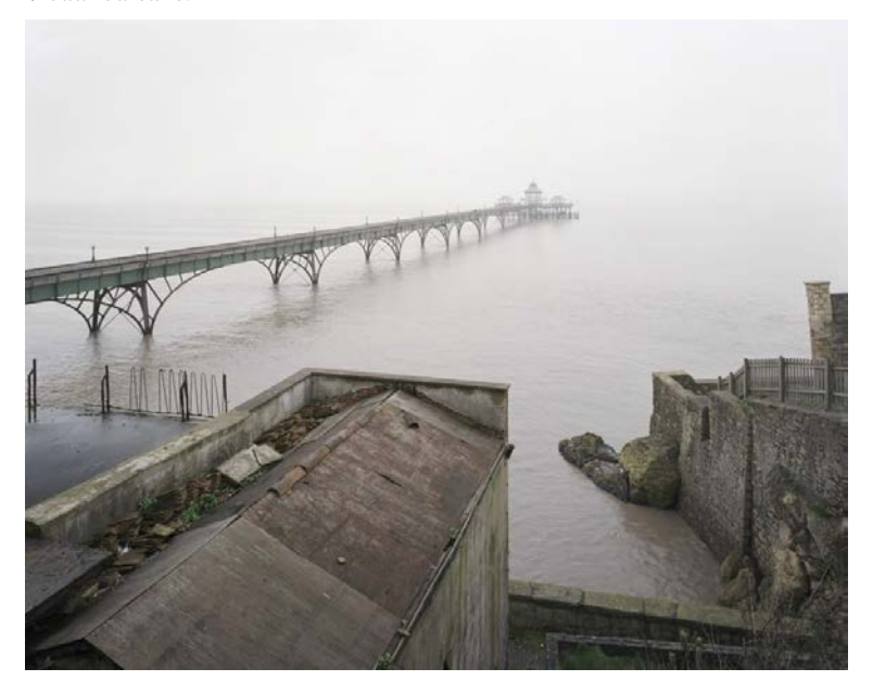
Fig. 2: Clevedon Pier #A, Somerset, February 2011.