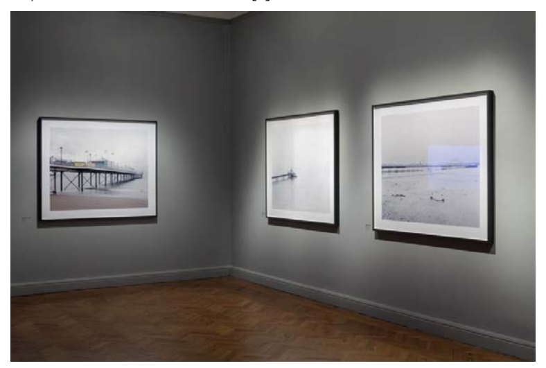
Fig. 3: Exhibition view.