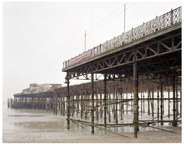
Fig. 7: Hastings Pier, East Sussex, March 2011.

lost from the British coastline – several of which are captured by Roberts in the form of poignantly open seascapes.