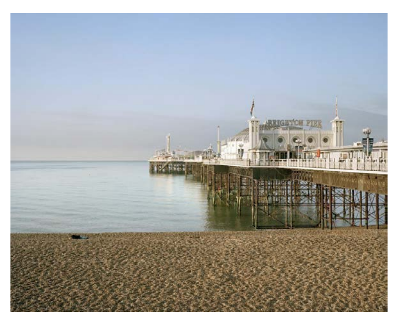
Fig. 6: Brighton Palace Pier #B, East Sussex, April 2013.

I could have photographed in a much more strict fashion, like I'd started [to...] but, actually, I thought [...] I don't want to be that strict because what I wanted to do was give a sense of seasons and time and, therefore, open it up [...] So, that, actually we begin to think about how these things have changed over time, [...] the different weather patterns that they've had to endure.