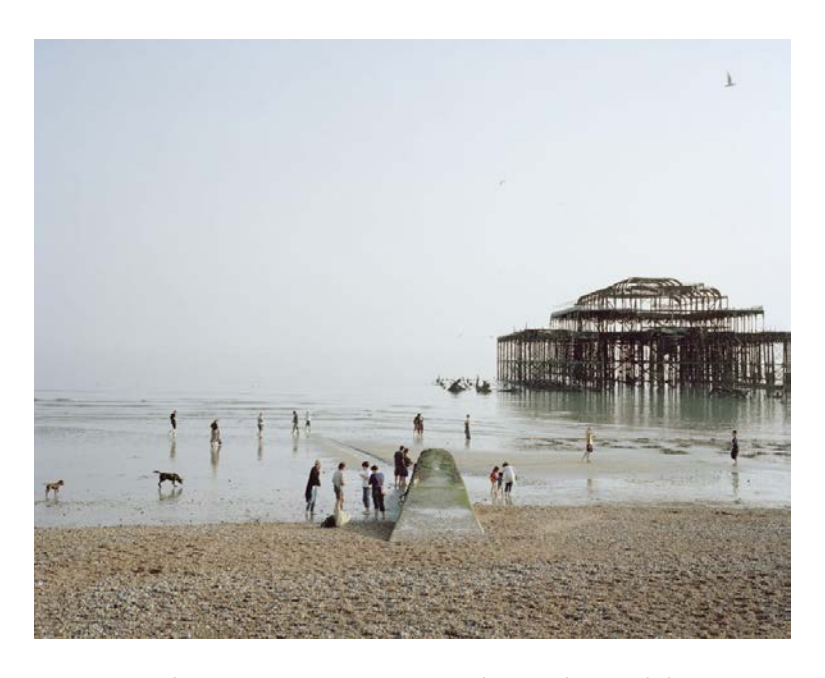
Fig. 1: Brighton West Pier, East Sussex, April 2011.

For me [...] the pier functions in two ways. You've got the tourists who go to the pier, and then you've got everybody who sits on the beach and looks at the pier. So actually, the pier is also a vista [...] a focal point in the sea, which I think people really engage with.