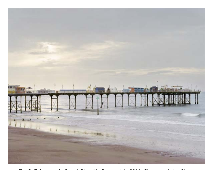
Fig. 5: Teignmouth Grand Pier #A, Devon, July 2011.

I think it was taken five in the morning after a Bank Holiday weekend so [folks] were sleeping it off, and I wanted that [image] because that tells me something about Brighton, and about [...] how people interact with Brighton and to some extent the pier is just a backdrop in the theatre of people's lives.