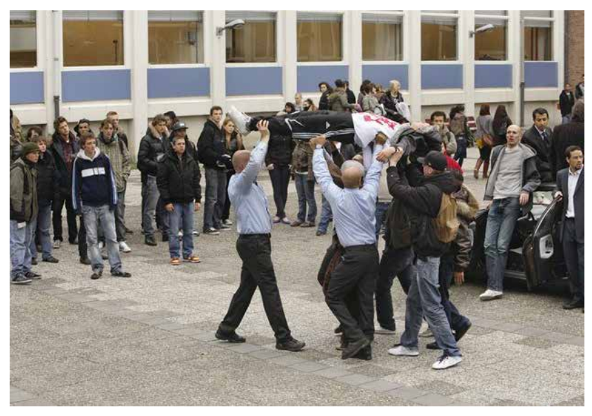
Fig. 3: Schoolyard (Aernout Mik, 2009).

recognisable archetypal media representations. For example, youths playing on and vandalising cars progressively evokes familiar suburban protests, while processions, in which an individual is hoisted up and transported by the crowd, evokes stock images of funeral processions in the Middle East. Through a subtle and gradual alteration in facial expressions and bodily movements, the procession turns into the suggestion of a football player being paraded around after having scored the winning goal. The piece is filled with morphing transitions between camaraderie and rivalry, pleasure and violence, of individuals being a part of, or disconnected from, the group's composition. On a basic level, Schoolyard raises questions regarding the emotional charge invested in media images, and how such images are internalised and acted out in everyday social situations.