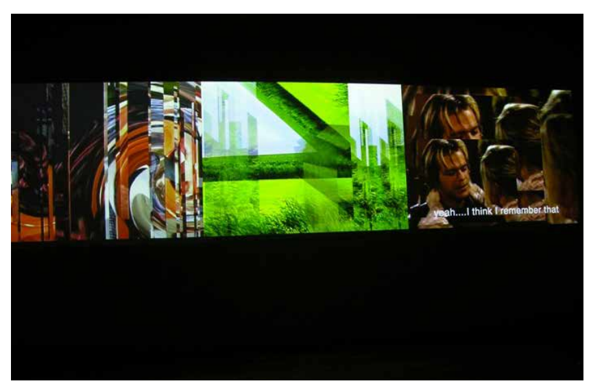
Fig. 1: Living Tomorrow (Linda Wallace, 2005).

fling of images and subtitles, murders take place, marriage proposals are made, and some are refused because the blond protagonist claims that 'she wants to wear the headscarf'. Woven into the unfolding narratives – through which a distinctly Dutch cultural and geographic landscape emerge – is the highly publicised 2004 murder of the Dutch film producer Theo van Gogh. Although the juxtapositions and connections in Living Tomorrow strike the viewer as fictive and even humorous, as the piece progresses she is confronted with something more complex: the many social, cultural, and political threads of a society are shown to intersect in new ways.