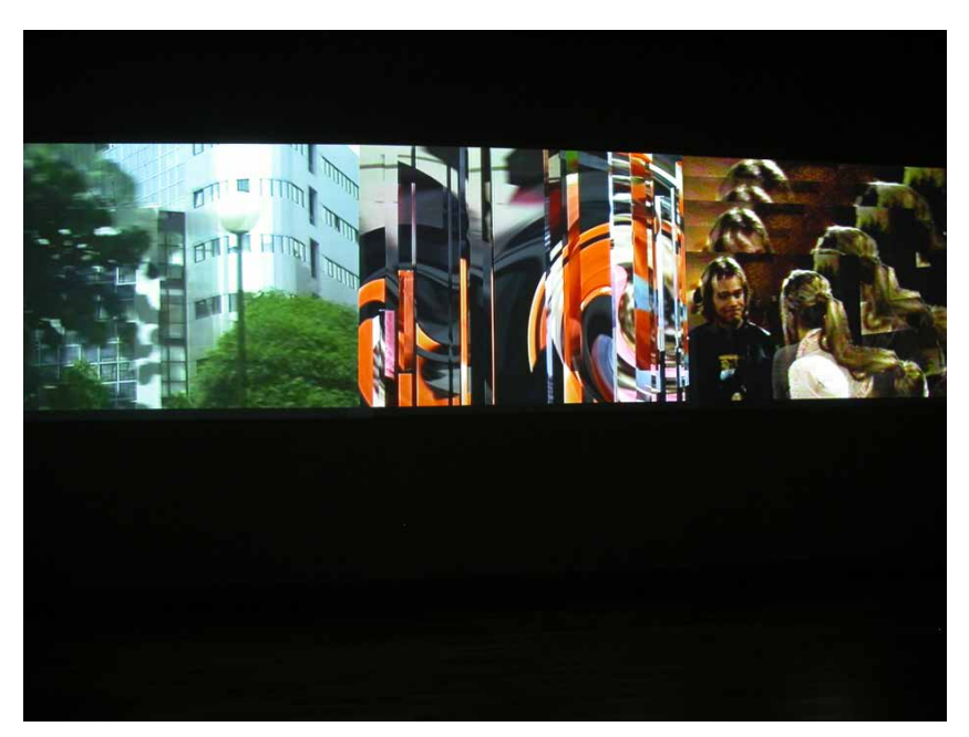
Fig. 4: Living Tomorrow.

In this work, representations are transformed into morphing surfaces that call to mind geometric patterns, textures, swirls, and folds.