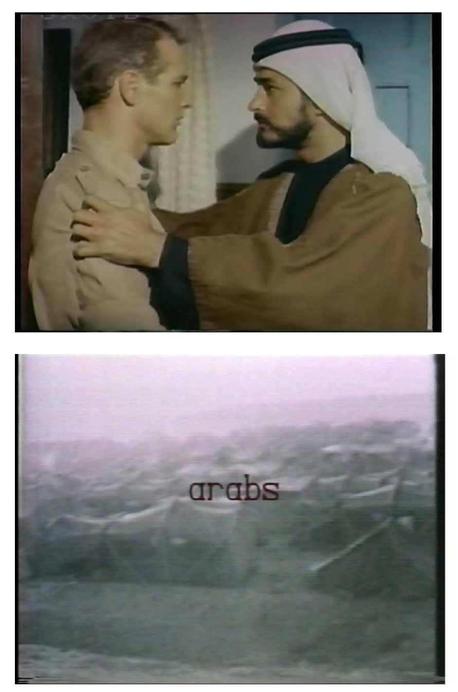
Fig. 2a, 2b, 2c, 2d: Introduction to the End of an Argument ( Jayce Salloum and Elia Suleiman, 1990 ).