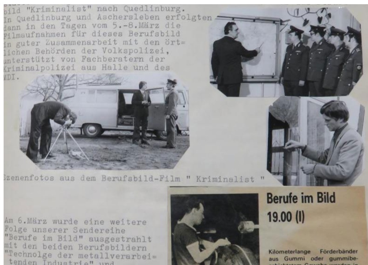
A page from Horst Klein's work diaries

This is a PDF-version of an online article: https://film-history.org/issues/text/work-and-life