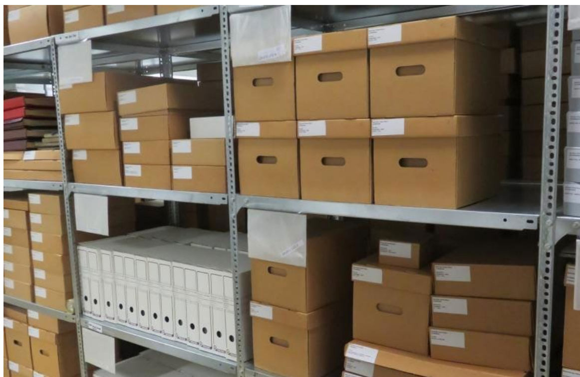
Writings and other documents of Horst Klein preserved at the Filmmuseum Potsdam

Horst Klein (1920–1994), whose writings, films, and other documents are preserved in the archive of the Filmmuseum Potsdam (Germany), is the central figure in the present case study.