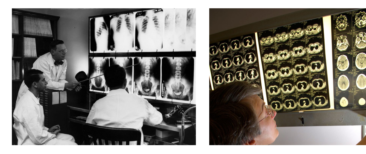
1 \quad \mbox{Photograph of $x$-ray diagnostics at Hermann Hospital in 1953 using a light box.}