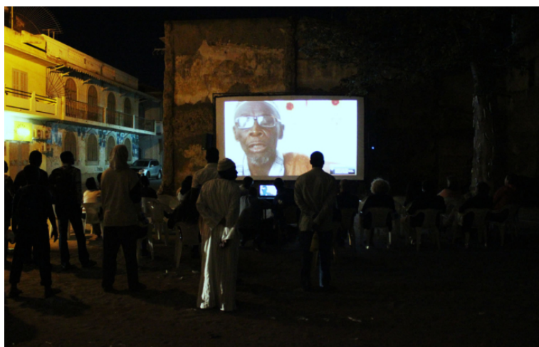
Fig. 2: Screening of African Photo, Mama Casset (Elisa Mereguetti, 2015) in the intersection of Kahlifa Ababacar Sy street and Aynina Fall street, during the 2015 festival.