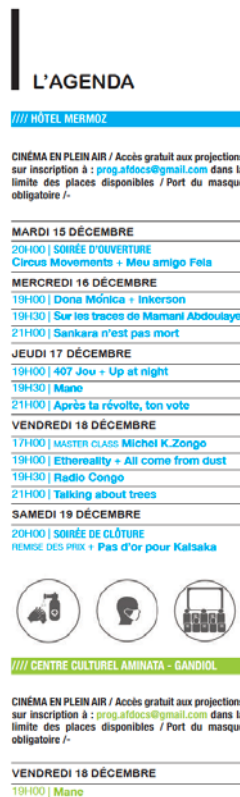
Fig. 3: Detail shot of the overview programme following its modification.

Plane tickets were bought, guests arrived, films and foldable screen were in hand, and bookings were confirmed in a hotel which had reopened its doors for the occasion after a very hard period for the tourism sector in Senegal. ‘We could not cancel it.’[10] It was about rethinking the festival programme in order to do it ‘as seriously as possible’.[11] The possibility of doing it online was promptly disregarded. This was ‘opposite to the philosophy of the festival to go and meet its audiences’.[12] In a period of social distancing, rethinking the festival format curated for its audiences meant also rethinking the idea of proximity.