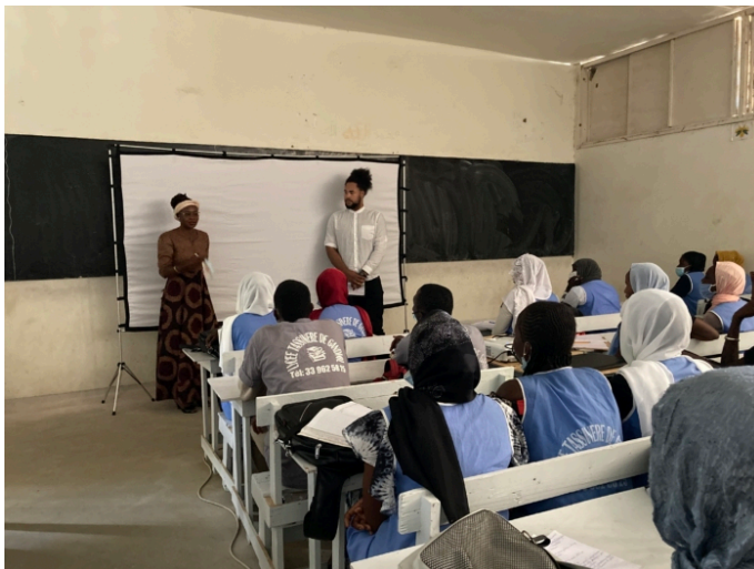
Figs 7, 8: Screening of Sur les traces de Mamani Abdoulaye at the Tassinere Gandiol Highschool.