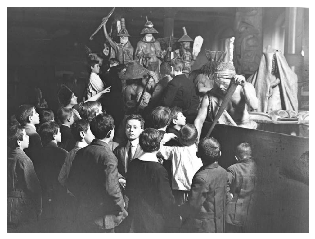
Fig. 4. Children viewing the Great Canoe, 1911.