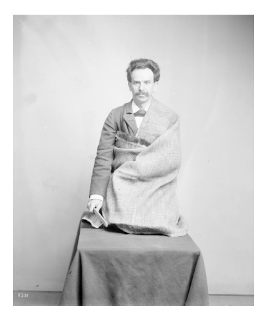
Fig. 3. Franz Boas Posing for Figure in an Exhibit Entitled »Hamats'a Coming Out of secret room,« c. 1895.

In addition to anthropologists and models, other people were also involved in the making of dioramas, as a case study of the dioramas made under the supervision of Arthur C. Parker at the New York State Museum in Albany will show.18 When it was impossible to obtain all the objects necessary for the full realization of a diorama, Arthur C. Parker took the liberty of fabricating them. The example of the garments is particularly striking in this context, since the plaster figures that used to exhibit various specimens (masks, baskets, and so on) also required shoes and garments to clothe them. In this context, he asked two Seneca-Oneida women, Alice Shongo and her daugh-