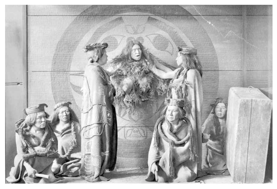
Fig. 2. Franz Boas, Hamat'sa Coming Out Of Secret Room: Ceremony for Expelling Cannibals 1895.

the photographs of Franz Boas taken during the construction of the Hamat'sa Life Group in 1895, which premiered that same year at the Cotton States and International Exposition (Atlanta World's Fair) before its permanent installation at the National Museum in Washington, D. C. (Fig. 2). The point of departure for this diorama was the field research that Boas had done the previous year on the ceremonies and regalia of the Kwakwaka'wakw. In an effort to communicate to his colleagues the iconography of the initiation ceremony represented in the group, Boas himself imitated the poses that he wished the figures to be given in the corridors of the museum (Fig. 3).<sup>16</sup> Thus, the anthropologist transmitted information not only through the photographs and notes taken during an expedition the previous year to Fort Rupert, Vancouver Island, but also by miming the way in which he wished to see the movements represented.<sup>17</sup>