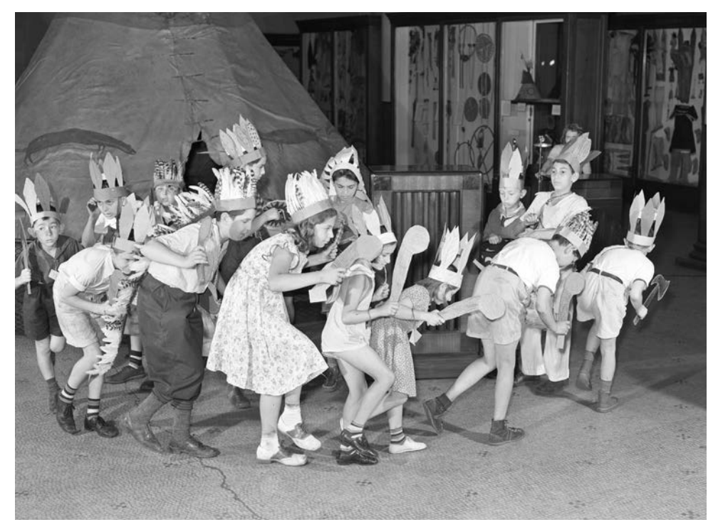
Fig. 5. Doing Indian Dances, Hall of Plains Indians, 1939.

between participation and observation, creating an experience for himself that was at once ludic, simulated, and real.