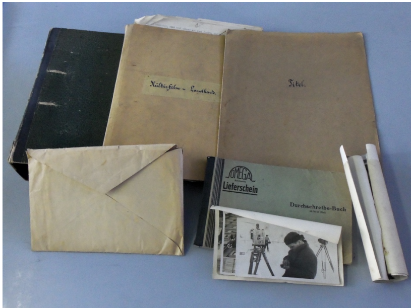
The surviving documents of Rudolf Mayer Film