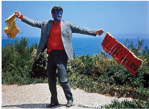
Fig. 3: PIERROT LE FOU (Jean-Luc Godard, FR/IT 1965): Pierrot, the symbol of the artist, is about to blow himself apart, annihilate the artist, and open the path to realization that life is greater than art.