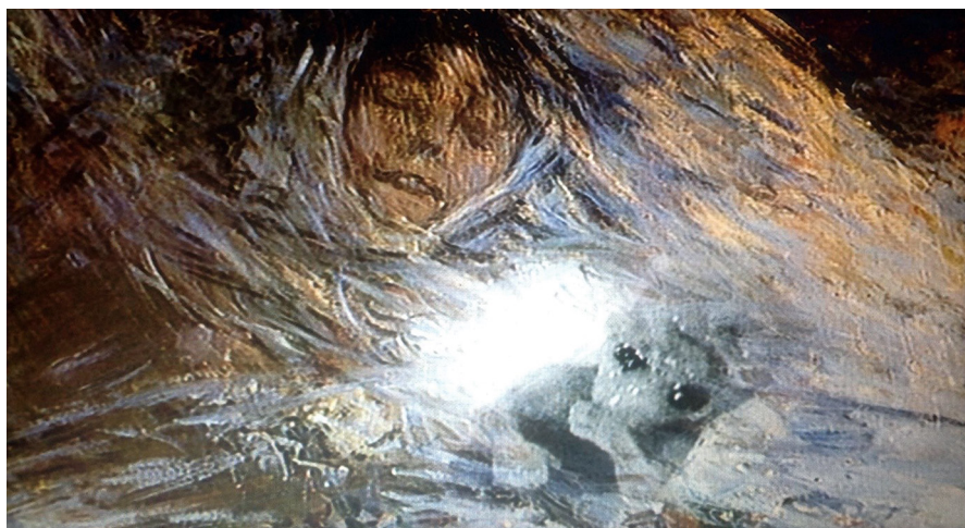
Fig. 13: HISTOIRE(S) DU CINÉMA: LA MONNAIE DE L'ABSOLU (Jean-Luc Godard, FR/CH 1998). "... here is the question, it's bigger than India, England or Russia, it's the small child inside the mother's womb".

realized that they have long disappeared into the dark of the night. If the key attempt of Godard's filmmaking was to use cinema as a tool that obliterates that very same tool and shows us the beauty of life, the only faithful way to end this essay is to use the words piled up here as a tool to destroy that very same tool and, like Wittgenstein at the end of his debut treatise 66 , leave us speechless and in awe under the starry sky of life and its infinite beauties, lying beyond what any camera or pen could capture. The purpose of this whole array of words is, therefore, to make the reader look away from them, being the same goal that Godard strived to attain throughout his entire filmmaking career. For, what point other than this could Godard be making with the opening scene of LA PARESSE , where the female protagonist reads a book and the page she reads shows an unpunctuated, grammatically broken excerpt from Beckett's Comment C'est : "Suddenly afar the step the voice nothing then suddenly something something then suddenly nothing suddenly afar the silence" 67 "Reality", after all, "is too complex for oral communication", as it is said in the opening scene of ALPHAVILLE , and all that language is, as Juliette from 2 OU 3 CHOSES QUE JE SAIS D'ELLE reminds us, is "the house man lives in", 68 suggesting the safety and comfort that abiding in it brings, but equally insinuating that the most exciting things, life as it were, happen strictly outside of it.