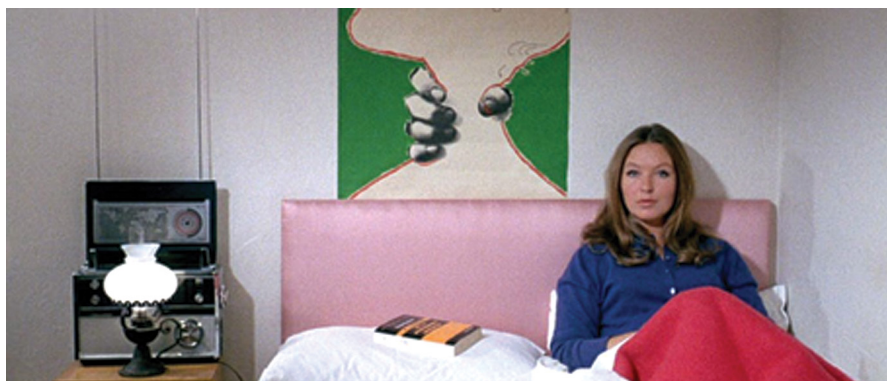
Fig. 5: 2 OU 3 CHOSES QUE JE SAIS D'ELLE (Jean-Luc Godard, FR/IT 1967). The movie marks a turning point in Godard's career, for it is his first cinematic essay in which images are accompanied by the narration using his own voice and in which characters are repeatedly directed to break the fourth wall by gazing directly at the camera and introduce themselves to the viewer.