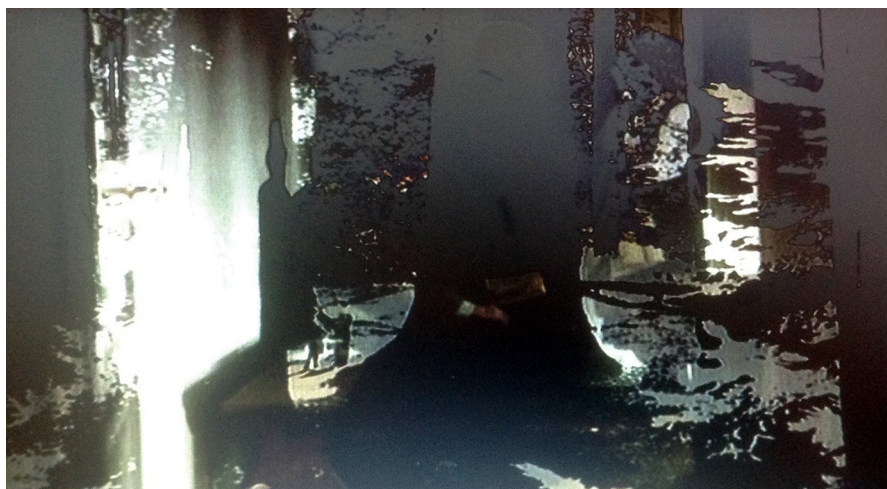
Fig. 6: HISTOIRE(S) DU CINÉMA: UNE VAGUE NOUVELLE (Jean-Luc Godard, FR/CH 1998). Godard is intercepted in his reading by two displeased young spectators and asks them, "Did you like it?" "We keep seeing images of the art pieces, but never people", they say, hinting at Godard's lack of interest in characters on the account of the interest in criticizing the art of cinema through his cinematic works, epitomized in his saying, "I don't make movies, I make cinema", to which end he could be justifiably considered as a film critic, not necessarily a filmmaker in the classical sense of the word. "You are right – art first, and then, the men", responds Godard. "Don't you have a heart", asks back the annoyed young lady, to which Godard says, "We can film the work, not the hearts", before lighting up a cigarette and continuing his musings in now empty room, with his confronters long gone: "Some times have too many hands and not even hearts; yes, times without hearts but not without work. When an era is sick and lacks work for all hands, it sends us a new exhortation. The exhortation to work with our hearts instead of using our hands. And I haven't known a time, not yet, that lacked work for all hearts" 26 .

If that is true, then Godard might not have only wanted to challenge the conventions, but he might have also strived to be an inspirational storyteller, even when this storytelling involved a thorough deconstruction of the story or at times its almost complete abandonment, all until a hardly recognizable, semi-ruinous structure would be left in place of what could have been a lavish edifice, complying all the while to his own guideline: "To make an image, you have to unmake it." 27 Famously, in 2 OU 3 CHOSES QUE JE SAIS D'ELLE, Godard deliberates what to focus his storytelling on, the protagonist or an autumn leaf, concluding that "both, on this October evening, trembled slightly" 28 and mirroring his own hesitant outlook thereby. Thus, one could say that, cinematic anarchist as he is, his style of creative