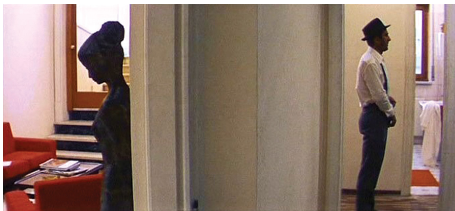
Fig. 9. LE MÉPRIS (Jean-Luc Godard, FR/IT 1963): The perplexed artist, the image of a muse, and the wall between them. Characters looking away, distancing themselves mentally and emotionally from one another, is a perpetual motif in Godard's film. Is it a sign of contempt, i.e. le mépris , for the society that, as Godard must have deemed, is necessary to elicit the qualities of enlightened being? Does it stem from the belief that one must reject society if one is to find one's true self and deliver the highest potential of one's being to the world?