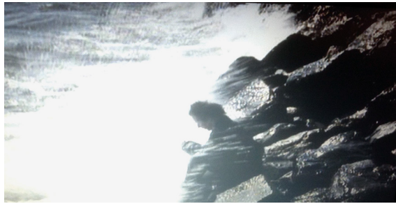
Fig. 1: HISTOIRE(S) DU CINEMA: UNE VAGUE NOUVELLE (Jean-Luc Godard, FR/CH 1998) – “It’s about time that the thought becomes once again what it really is: dangerous for the thinker.” 3