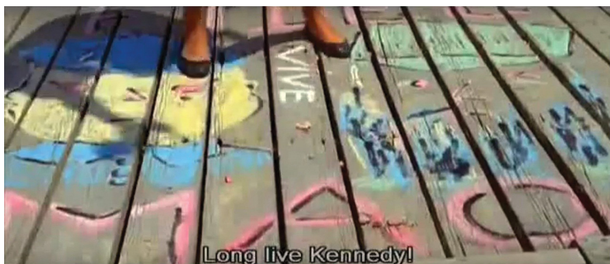
Fig. 2: PIERROT LE FOU (Jean-Luc Godard, FR/IT 1965): Pierrot and Marianne impersonate Uncle Sam's nephew and Uncle Ho's niece, as they make fun of American tourists. Godard has never hidden his anti-American sentiments and has repeatedly assaulted the fabric of the American culture, from its cutthroat capitalism to shallow, mediocrity-fostering commercialism to prostituted professionalism and beyond. As an illustration, his 1967 manifesto insinuates the intention to demolish "the vast Hollywood-Cinecitta-Mosfilm-Pinewood etc. empire" and "create cinemas which are national, free, brotherly, comradely and bonded in friendship." 12 Hinting at the manipulative machinery of Hollywood, Godard turned cinema halls into mass execution sites for those who refused to conform to the dehumanized lifestyle of Alphaville. 13 Hollywood cinemas, per Godard's metaphor, thus become halls where the spiritual is subtracted from the material and which brainwashed attendees leave deadened on the inside.

(Jean-Luc Godard, FR 2014). 14 The greatness of an act is thus measured by the extent to which it reaches out away from the subject and into the world, away from I and into the heart of that ethereal, Buberian Thou. It is for this reason