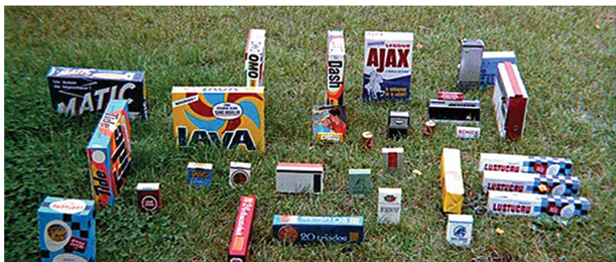
Fig. 8: 2 OU 3 CHOSES QUE JE SAIS D'ELLE (Jean-Luc Godard, FR/IT 1967). The final image, of a colorful graveyard composed of boxes of detergents and other inanimate denizens of supermarket shelves, epitomizes the essence of the deliberately shallow pop artiness; does it arise from a state of true enlightenment or from sheer stupidity and years of brainwashing with the surface values? Not incidentally at all, in this miniature model of a luxurious high-rise banlieue of Paris, itself a model of an alienating urban landscape, itself a model of modern society, one finds a box of Hollywood bubblegum.

being that not even the finest traces of submission to social standards could be found therein. Still, science is indisputably a social question and must be analyzed from a variety of nonscientific perspectives in order to be approached in a creative fashion. For this reason, the narrowness and linearity of the scientific method followed by the academic masses is mercilessly fought against in my lab and classroom, all in an attempt to lift this new generation of scientists to the top of Bloom's taxonomy pyramid, where the creative and the metacognitive intersect. 38 As for (b), the aim has been to discard the old, rigid way of presenting science, be it in the written or the oral form, and substitute it with a style that signifies spontaneity and more veritably reflects the route to innovative ideas along the corridors of the human mind, which is such that it relies on analogies, poetry, swells of aesthetic senses and intuitive flashes of light along the way. As for (c), the idea that siding with the disempowered must be the way to go in my roaming through the chambers of the Kafkaesque castle that the Ivory Tower is has been another guiding light, the reason why everything, from experimental methods to research subjects to researchers and collaborators to research locations to political voices aired through these lungs, has been adjusted to afflict the affluent and uplift the poor and the underprivileged.