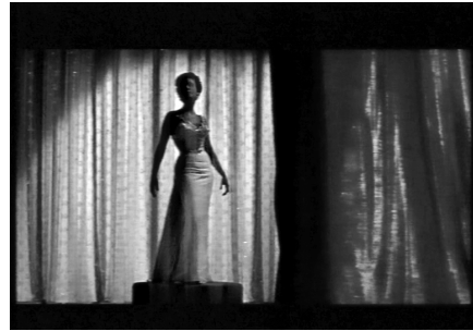
»If You Can Dream«, Meet Me in Las Vegas

Yet if she most often has literally little room for manoeuvre, this does not mean that the space does in fact utterly contain her. She has a small cabaret space for »Come Out of the Clouds« (THE DUCHESS OF IDAHO, USA 1950, Robert Z. Leonard), for instance, which she enters down a short and narrow flight of stairs. Yet as the number proceeds, the camera follows her movements to encompass an ever widening space, which even towards the end takes in some clients sitting at a table. At one point near the beginning of the number, while Horne is still at the end of the short run of steps, she puts her left foot up on a bench to the side of the stairwell, crooking her leg, and puts her hand on her hip, as the song admonishes » Baby , come of the clouds«; it is a somewhat unusual pose for a woman and even more for Horne, suggesting a deliberate taking up of space and one that precedes her beginning to make fuller use of the small performance space available. It is a little defiance of confinement.