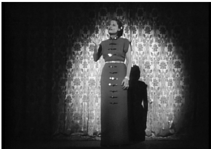
›Don't let our love song ...