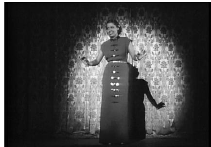
... turn into a blues.‹