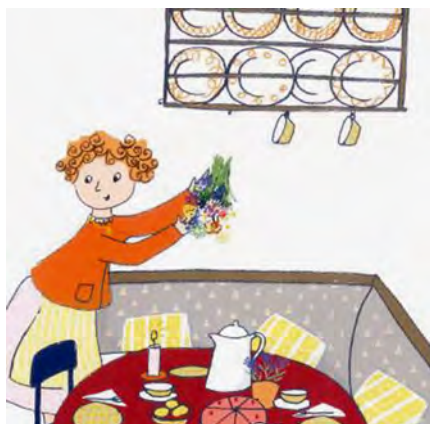
Fig. 11: Customs and traditions in Pana/Bandlow (illust.), Jana und Teresa feiern Himmelfahrt (n. pag.).

Those characters that represent own identities often visit the characters that represent foreign identities on religious holidays to learn about traditions and rituals. Each narration informs the reader about particular dishes that are prepared and eaten in specific foreign countries. The authors compare traditional dishes with food the reader may know: “Family Wang eat Jiaozi at the spring festival. This is pasta filled with meat and vegetables like ravioli or Maultaschen.” 30