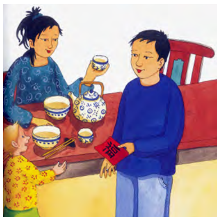
Fig. 9: Emma perceives Chinese letters as “strange signs” in Yu-Dembski/Leberer (illustr.), Lili und das chinesische Frühlingsfest (n. pag.)