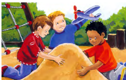
Fig. 4: The Tanzanian character Mwangaza in Ngonyani/Flad (illustr.), Mwangaza und die Geschichte mit dem Zahn (n. pag.)