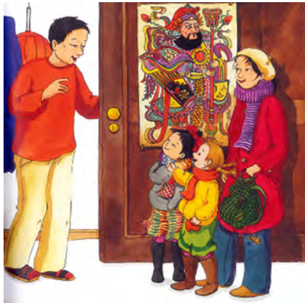
Fig. 14: Interior design in Yu-Dembksi/Leberer (illustr.), Lili und das chinesische Frühlingsfest (n. pag.)