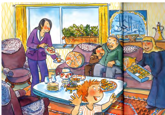
Fig. 12: Representation of Muslim identities in Halberstam/Tust (illust.), Levent und das Zuckerfest (n. pag.) © Carlsen Verlag GmbH, Hamburg 2011.

The illustrations of tableware and cooking utensils along with the interior design represent material culture and visualise own and foreign identities. The objects depicted are often accompanied by religious symbols. Levent’s Turkish background is evident from the many postcards from Turkey, posters with football players wearing the shirts of the Turkish national team, a doormat with the inscription “Merhaba” and an alarm clock in the shape of a mosque. An image of the Basmala “مي حرلا ن محرلا ل الله مسب” (“In the name of Allah, the Most Gracious, the Most Merciful”) decorates his grandparents’ living room (fig. 12).