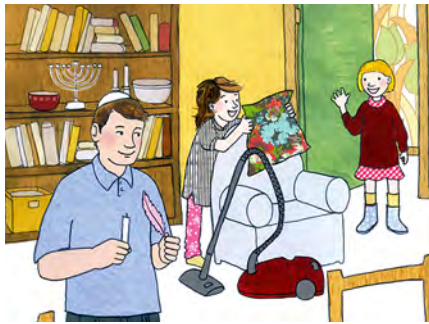
Fig. 13: Interior design and material culture in Halberstam/Späth (illustr.), Lena feiert Pessach mit Alma (n. pag.) © Carlsen Verlag GmbH, Hamburg 2011.