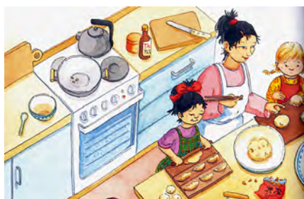
Fig.6–8: A facial expression of nescience and admiration in Yu-Dembskij/Leberer (illustr.), Lili und das chinesische Frühlingsfest (n. pag) © Carlsen Verlag GmbH, Hamburg 2011.