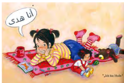
Fig. 10: Arabic language and lettering in Taufiq/ Spanjardt (illustr.), Huda bekommt ein Brüderchen (n. pag.) © Carlsen Verlag GmbH, Hamburg 2011.

lar group, on the one hand, and to form the sense of belonging to the community, on the other. 24