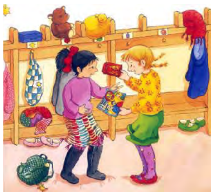
Fig. 2: Spaces and settings in Yu-Dembksi/Leberer (illust.), Lili und das chinesische Frühlingsfest (n. pag.) © Carlsen Verlag GmbH, Hamburg 2011.

and religion are set in a school or a nursery school (fig. 2), meeting places where children with diverse cultural, religious and national backgrounds come together. In addition, children who represent foreign identities often invite figures who represent locals into their private living environment to make the latter familiar with specific cultural practices such as festivities and customs.