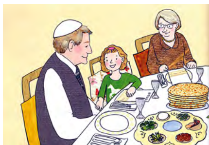
Fig. 16: Representing the grandmother's Muslim identity in Taufiq/Spanjardt (illustr.), Huda bekommt ein Brüderchen (n. pag.)