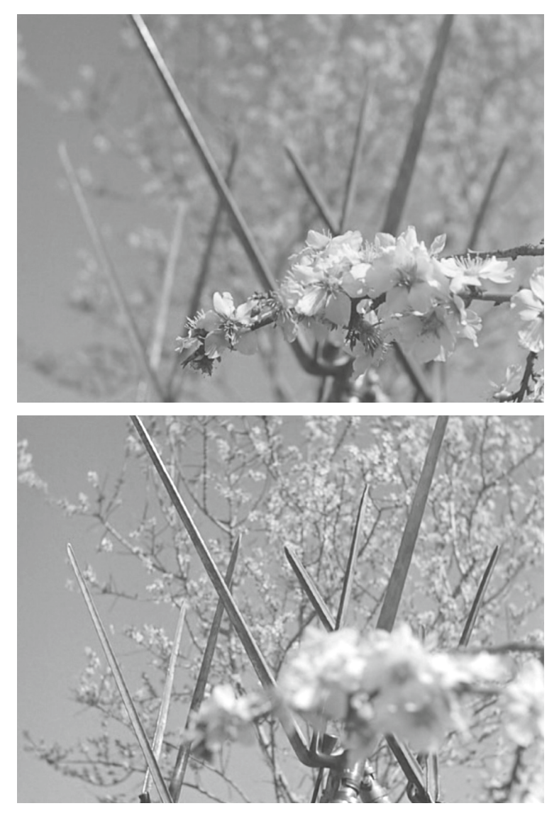
Figs. 3 and 4: Different focus in the same shot.