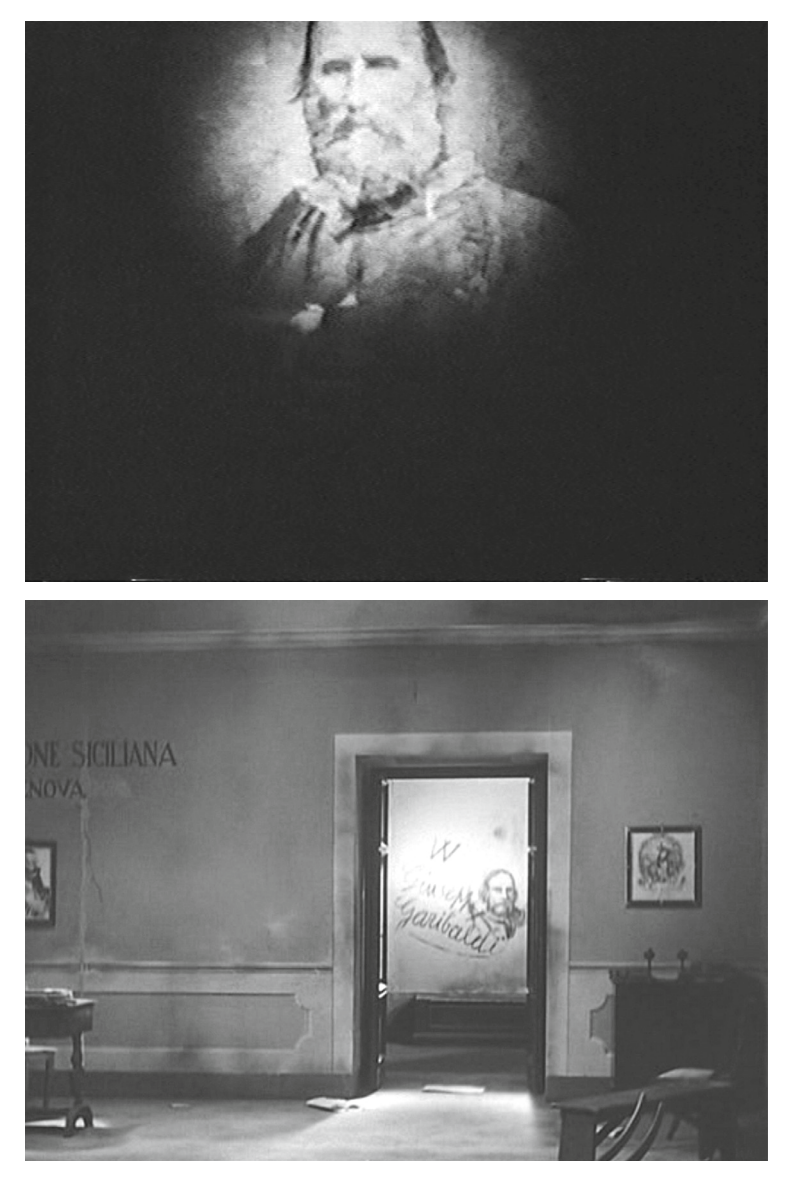
Figs. 7 and 8: Effigies of Garibaldi in II grido dell'aquila and 18 60 respectively.