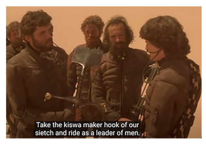
Fig. 4: Stilgar explaining how to ride the sandworm on Arrakis to Paul, Dune (1984).