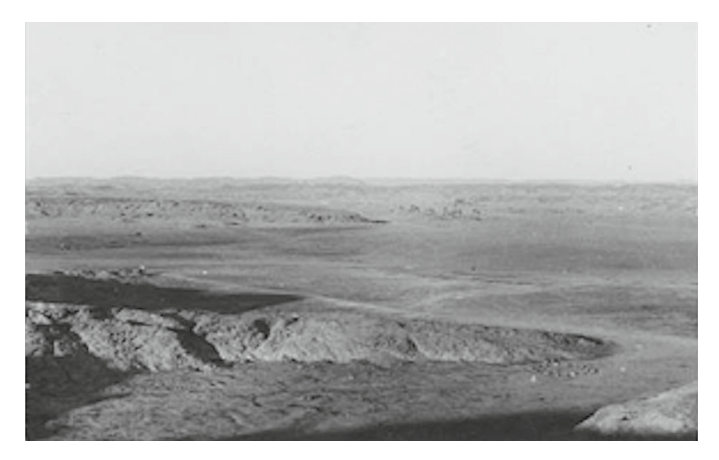
Fig. 2: View of the desert near Wejh; T.E. Lawrence Collection, Imperial War Museum, Q 59014.