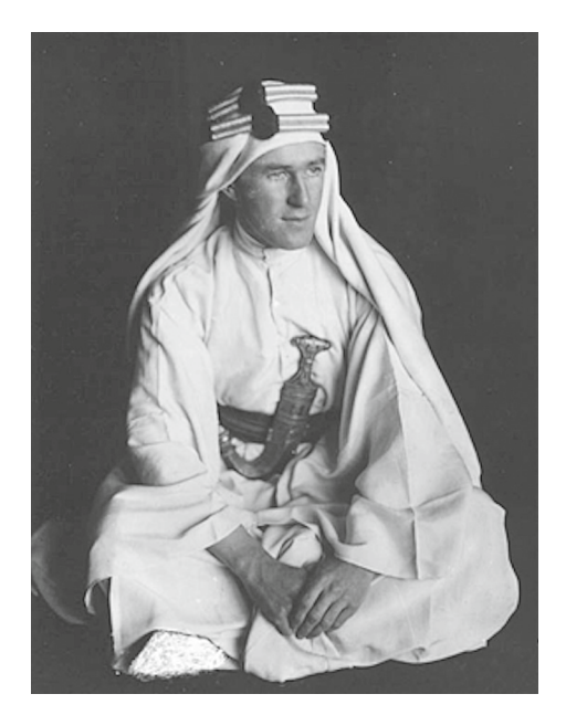
Fig. 1: T.E. Lawrence; T.E. Lawrence Collection, Imperial War Museum, Q 73535.

while the British officer coordinates the military actions of the indigenous people and in a way solely uses their potential in the name and for the sake of the British Empire, which Lawrence initially seems to have wanted to avoid so as to create an independent Middle East instead, Paul not only uses the Fremen locally but leads them straight into an intergalactic jihad. Other Western powers had tried to exploit the idea of a holy war of the Muslims against foreign rule before, but Lawrence acted rather pragmatically, and Feisal seemed politically experienced enough not to mix religion and politics. While Paul is also the center of a myth related to his military victories and his final