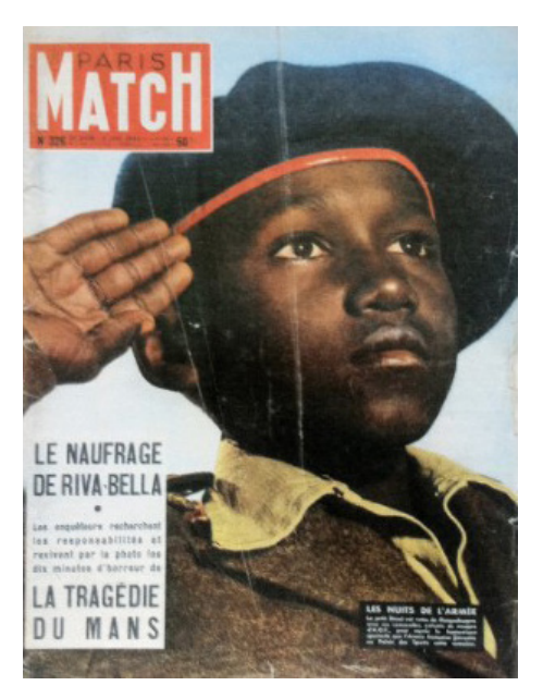
Fig. 1: Cover of Paris Match , June 26, 1965. The parade La Nuit des Armées is noted on the photo but is not referenced by Barthes.

in 1956/57, the year of the book's publication; not only had France lost Indochina and continued to wage war over ownership of Algeria, but the Rassemblement démocratique africain (RDA, African Democratic Assembly) had also been fueling movements in West Africa, where independence was imminent. The Match photo illustrates the political axis of the mainstream press in the thrall of censorship for any content about war in the French colonies and instead bolsters French patriotism. Barthes' commentary on the image's manipulation of its readers suggests the governmental and societal pressure to uphold a lie, though his blame in this essay is but implied.<sup>7</sup>