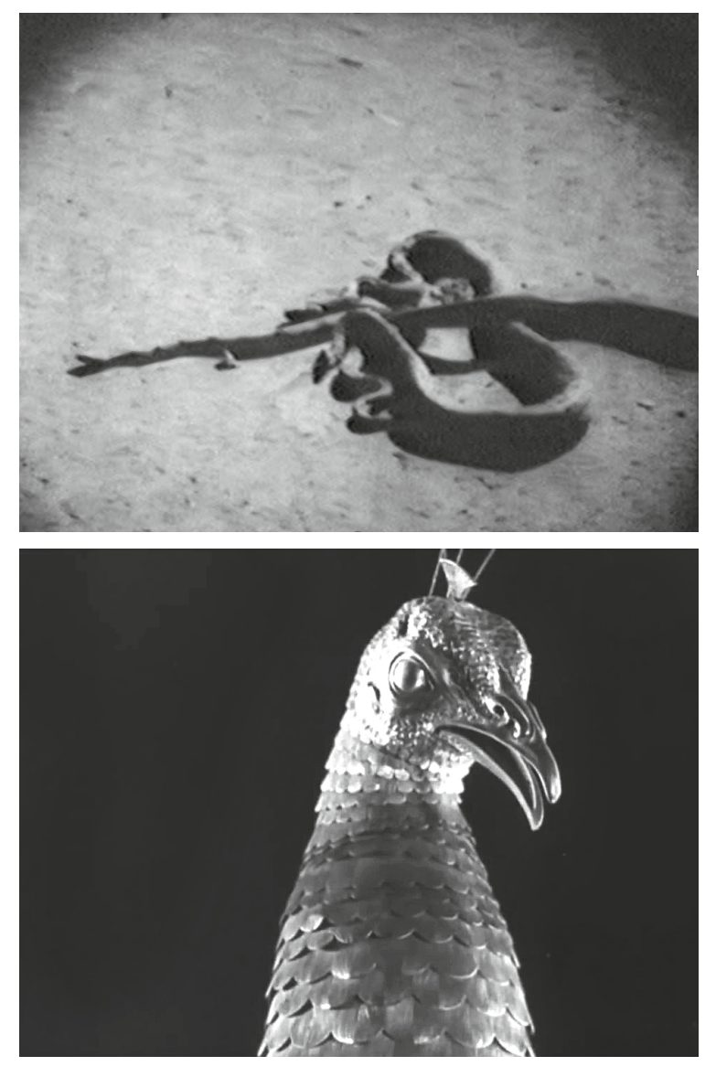
Figs. 1 and 2: Snakes in II grido dell'aquila and mechanical peacock in October .