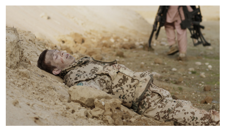
Fig. 1: Omer Fast, Continuity, 2012. Film still.

Avail Themselves (The Disasters of War, 1810–1820) is a contemporary version of the history painting. Susan Sontag sees in the staging of this scene—where the mutilated, bloody bodies of Russian soldiers are represented as they laugh and chat—the ability to depict reality more precisely.