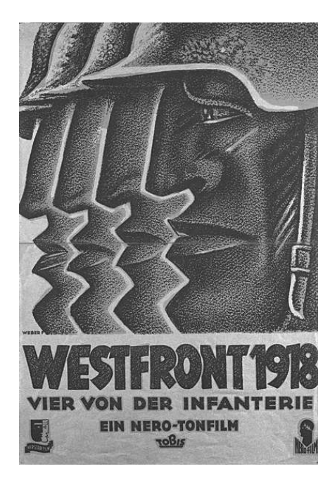
Fig. 1: Movie Poster Westfront 1918.

War but also, with some specific variations, for the Vietnam War in unusual movies like Francis Ford Coppola's Apocalypse Now (1979) and Michael Cimino's The Deerhunter (1978), extending to Oliver Stone's Platoon (1986) and Stanley Kubrick's Full Metal Jacket (1987) (although Vietnam created the opportunity to implement some specific variations).<sup>5</sup>