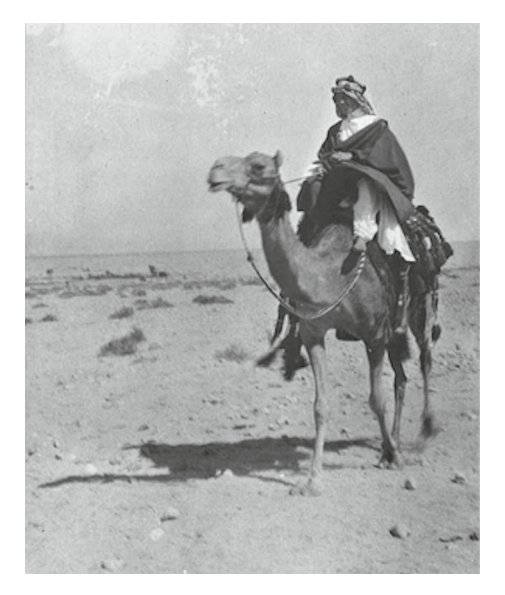
Fig. 5: Lawrence on a Camel, Akaba, n.d.; T.E. Lawrence Collection, Imperial War Museum, Q 60212.