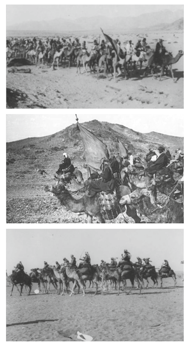
Fig. 6–8: Images of Camels related to Lawrence's operations, 1916–1918; T.E. Lawrence Collection, Imperial War Museum, Q 59073, Q 58861 and Q 59018.