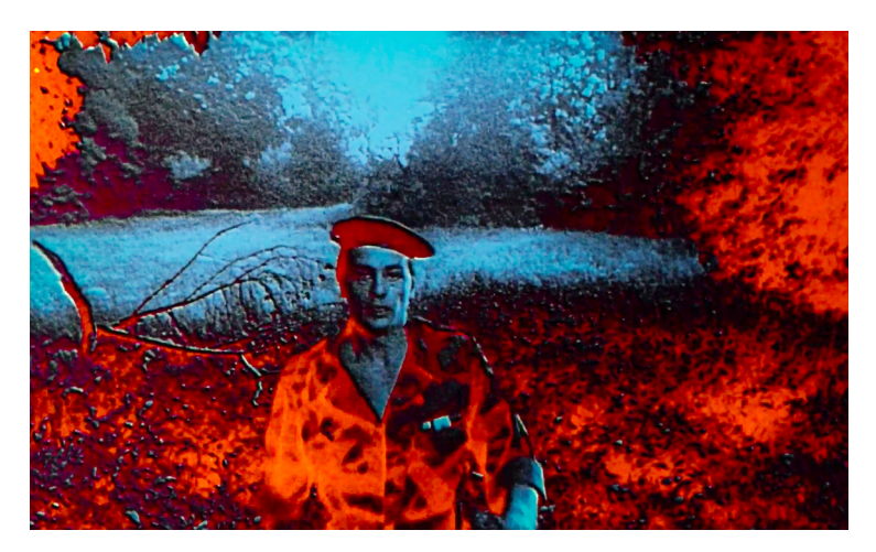
Fig. 7: The first of two flashbacks of Algeria in Diaboliquement vôtre (1967, dir. Julien Duvivier).

oticism's illusion and, in this last sentence, suggests an awareness of a strong resistance to colonialist ideology and representations.