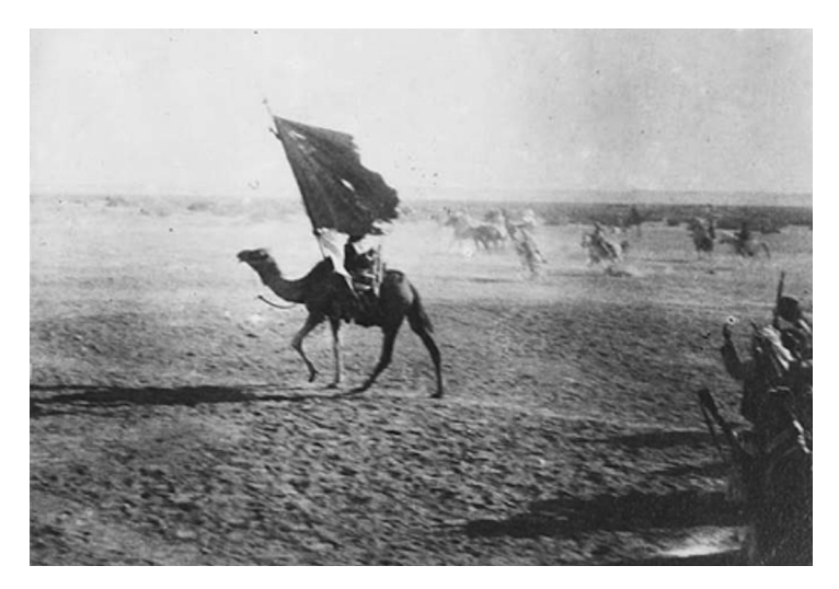
Fig. 9: The triumphal entry into Akaba, 6 July 1917, T.E. Lawrence Collection, Imperial War Museum, Q 59193.

the Emperor's forces in their surprise appearance,«<sup>125</sup> almost like a massive wall of camels when they hit the enemy lines during a full-speed advance.<sup>126</sup> As efficient mounted forces, the description of the sandworms and their final attack consequently closely match Lawrence's story about camels and their use during his campaigns.