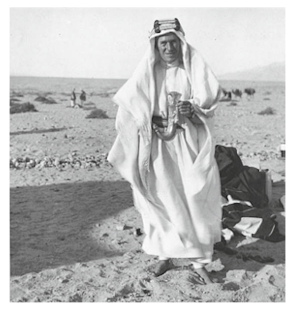
Fig. 3: T.E. Lawrence, n.d.; T.E. Lawrence Collection, Imperial War Museum, Q 59314.