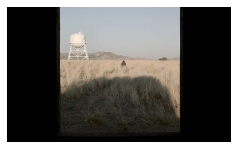
Fig. 4: Still from Heli : frame within a frame and violence from a distance.

trast of the building's interior creating a dark frame around the shot. Heli chases the man to the middle of the frame, tackles him, and begins to kick and hit him until his body stops resisting and lies still. The sound of the murder is barely audible over the diegetic sound of the TV program the man was listening to. Instead, we hear a presenter talk about how to make God hear our prayers. The words create a stark contrast with the actions of Heli, which reflect his taking justice into his own hands.