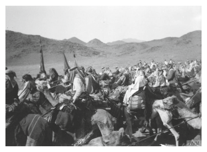
Fig. 10: Ageyl bodyguard, n.d.

rial worlds both represent and the indigenous one the two men dive deep into. Lawrence's superiors also had no doubt at all that it was the part played by the British officers that was decisive for victory, an aspect that Herbert, consciously or unconsciously, also emphasized, as the Fremen only began to be successful in their military operations after Paul joined them.