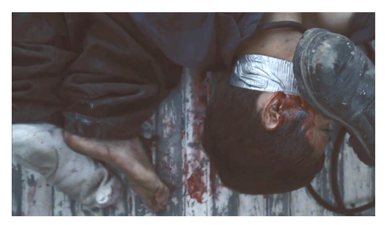
Fig. 1: Opening shot from Heli : feet, bound head, and boot in the bed of a truck.

Among the many similarities between these films, the presentation of both stories disturbs linear time: Heli to create a looming sense of peril, and Ya no estoy aquí to show a before and after in the protagonist's life. In both cases, the rupture of timelines gestures to the very essence of life under the necropolitical system. That is, the chaos, terror and monotony of living with the constant threat of violence and death. As both films illustrate, this is an unliveable scenario where conditions of precarity and insecurity reign supreme.