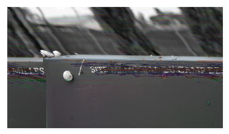
Fig. 2: Maya Schweizer, Der sterbende Soldat von Les Milles, 2014.

observed through the analytical lens of the camera that moves across space and yet never gives us a full sense of it.