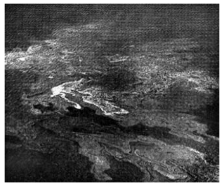
Fig. 3: «Technisch und örtlich wie Abb.1. Bei etwas niedrigerer Flughöhe und stärker gesenkter Aufnahmerichtung wird der Einblick und die Durchsicht in die Struktur der Pollensuspension deutlicher. Besonders klar erscheint der Ansatz zu rhythmischer Fällung, in Art der LIESEGANG'schen Ringe, im Vordergrund.» («Abb.1: Schrägaufnahme mit Fliegerhandkamera, aus Dornier-Delphin-Flugboot des Bodensee-Aerolloyd durch Pilot W. Truckenbrodt, Anfang Juni 1929 vor dem Konstanzer Trichter im Obersee zwischen Horn (Landspitze des badischen Bodanrücken) und Münsterlingen (Kanton Thurgau), auf Ersuchen des Verf's aufgenommen. Flughöhe ca. 300m, man sieht auf der leicht gewellten Seefläche breite Zonen mit Pollenregen erfüllt, in der Mitte ein typischer gerundeter Streifen dicht schwefelgelb angereichterter Pollen.»)

«The significance of aviation as a means of limnological research in its own right lies in being able to look at the inland waters from above, to look into them, onto them and through them – all of which is possible only when moving at altitude»<sup>52</sup>