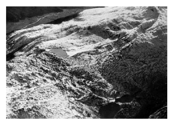
Fig. 4: «Grimselpaß-Seen. Blick vom Aaeretalursprung nach S über Grimselpaß (2165 m) mit Hospiz, Passstrasse, Grimselsee (1875 m) und Totensee (2166 m) ins Obere Rhonetal mit Dorf Obergestelen (Oberwallis). Flughöhe 4000 m. Glaziale Rundhöckerlandschaft, die Paßseen durch Eisschliff entstanden. Luftbild zeigt regionale Bestimmtheit des hochalpinen Urgebirgssees. Nährstoffarme Unterlage (Gneisgranit, Hornblendeprotogine, Schneedecke spät ausapernd wie auf dem Bild, kümmerliche Vegetationsdecke) Ursache der Oligo-Dystrophie der meisten Paßseen im Hochgebirge, Humusbildung über Waldgrenze, bei fehlendem Kalk sowohl unter wie über Wasser typischer Boden, bezeichnend auch Name «Totensee», ähnlich häufig in gleicher Lage auch «Schwarzer See». Luftbild Einsicht auf Landschaftsbild, Zusammenhang mit Seenentstehung, Übersicht und Aufsicht auf Bodenbildung. Klima und Seetyp als Folge. Hingegen Vertikalgliederung zugunsten des glazigenen Eindrucks zu gering hervorgehoben, vgl. Abbildung bei Collet (Taf. I), mit Blick vom Nägelisgrätli herunter, dort Bodenbildung aus geringerer Höhe mit seinen Vor- und Nachteilen. Abgedruckt auch bei Pesta, dort weitere Lit.