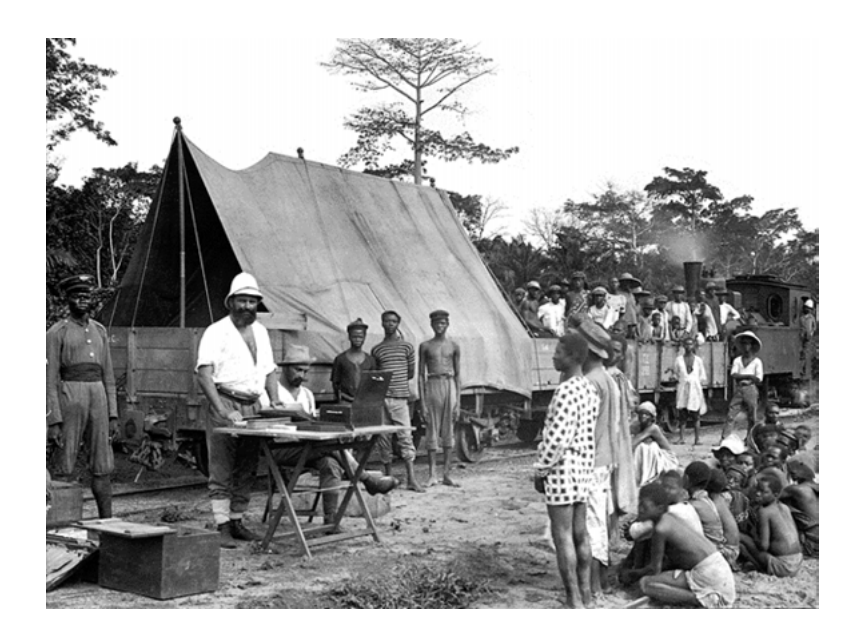
Figure 4: Few pictures incorporate the "colonial idea" more thoroughly than this photograph from the Simon Collection. Unlike the greater part of this corpus of pictures on glass plates, this picture is contained in a small album and only exists as a paper print. Judging from the other pictures in the album, we can estimate that it was not taken by Simon himself, but was bought from Alex Acolatse's studio (David 1992). Part of Acolatse's business was to sell photographs of the colony to the Germans before they returned to the homeland. These were readymade as prints on paper and arranged in an album. The habitus of brevity represents the affirmative attitude toward the iconographically composed pictorial elements: the steaming train in the background as a sign of modernism, the distribution of money (the compulsory workers received a so-called "food allowance"), the police violence in the background (on the very left side in the picture) and the dress code, showing the Europeans in white clothing and the Africans mostly half-naked. The only detail that disturbs this affirmative harmony is the bored gesture of the seated European, who obviously has no active part in this scene. Presumably, it is Simon himself.