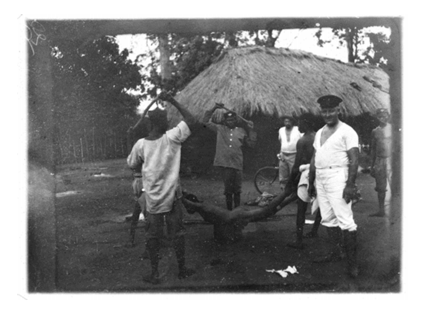
Figure 2: This picture belongs to the private collection of Dr. Rudolf Simon, who was a government physician in Togo 1910–14. His primary responsibility was taking care of the "compulsory workers" (Pflichtarbeiter) during the construction of the Togo railway (Hahn 2004d, 2007). His collection of photographs, today housed in the museum of local history (Heimatmuseum) in Zusmarshausen, comprises mostly private photographs that more or less represent the non-official side of everyday colonial life. The scene depicted here – the beating of a Togolese man with short segments of heavy rope – apparently required the presence of the public health officer. In other words, witnessing these punishments was part of his official duty. And yet, the picture is not an official self-portrayal. The intensity of the violence depicted causes the picture to contradict the self-defined image of Togo as an ideal colony. It is actually a very rare picture.

Chaudhary (2005) calls this a "phantasmagoric aesthetics" – a fascination for horror that is able to portray boundless violence in such a cool and distanced manner only because it is attributed to the "other", the colonial subject. Total control of the body belongs to this phantasmagoric idea of control. The emotions on the people's faces reflect an absolute distance from the scene. Coombes (1994) discusses similar reproductions, including a scene photographed immediately after the destruction of the palace in Benin City. In the middle of the ruins, a colonial officer sits in a casual pose. In front of him are the palace's art treasures that soon will be confiscated as war booty.