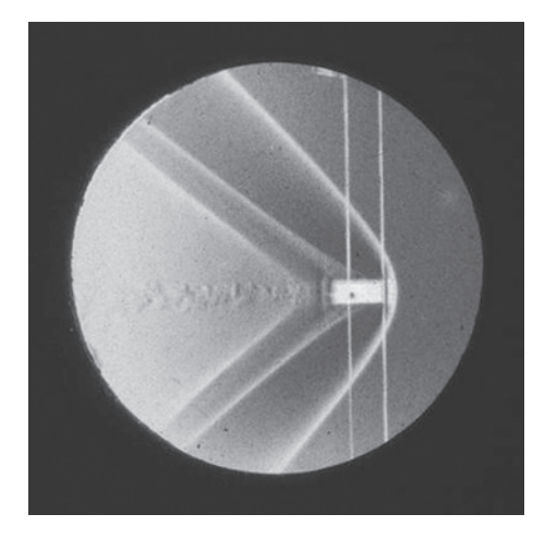
Fig. 1: Ernst Mach, supersonic projectile, Schlieren image, 1888

importance of thought experiments. Mach was deemed a »positivist«—a designation that implied an investment in empirical evidence as the be-all-end-all of the knowable world. And not only was he seen as a positivist, he was equally exalted and reviled as the high priest of positivism. Georg Lukács denounced impoverished forms of realism as »Neo-Machism,« the logical positivists of the Vienna Circle named an extension of their group the »Ernst Mach Society,« and his reputation became bound to the losing side of a debate in which he criticized Max Planck and others for granting the atom »a reality outside of thought.«<sup>5</sup> Mach's legacy was inseparably, if mistakenly, linked to a bloody-minded belief in direct observation as the final standard in the legitimacy of scientific claims.