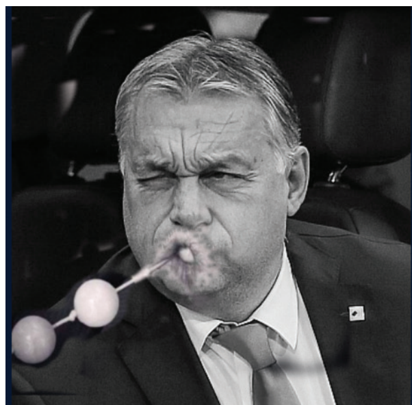
Figure 11. Orbán and anal beads.

An exemplary illustration of this in the Hungarian case is a meme (Figure 11) which depicts Prime Minister Orbán famously puckered lips while speaking, over which is imposed an anus with an anal bead sex toy protruding. The most obvious implication of his words being shit is very clear, and this also harkens to the Hungarian proverb “Segget csinál a szájából”, someone who “makes a butt out of his mouth” meaning one who does not fulfil his promises or talks out of his ass. An additional layer relates to the inclusion of a sex toy – especially anal beads which are predominantly popular among the gay community – which over the mouth of a famously homophobic man is especially mocking. While ridiculous, it is the absurdity of memes like these mocking Orbán personally that serve as a challenge and subversion of his political legitimacy and image as a competent leader.