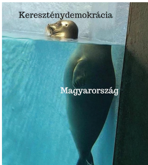
Figure 4. (Top text, translated from Hungarian) 'Christian Democracy' (Bottom text) 'Hungary'.