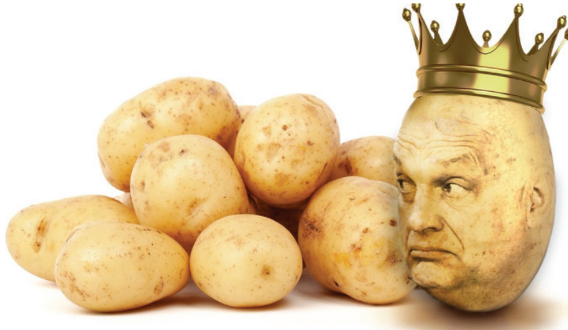
Figure 10. Potato King Orbán.

A final important element is the use of mocking to criticize political figures. Socialist television satire would parody a figure in order to challenge their legitimacy and the established order, and memes today have a special preference for making political figures the butt of the joke as a means of subverting everything they stand for.