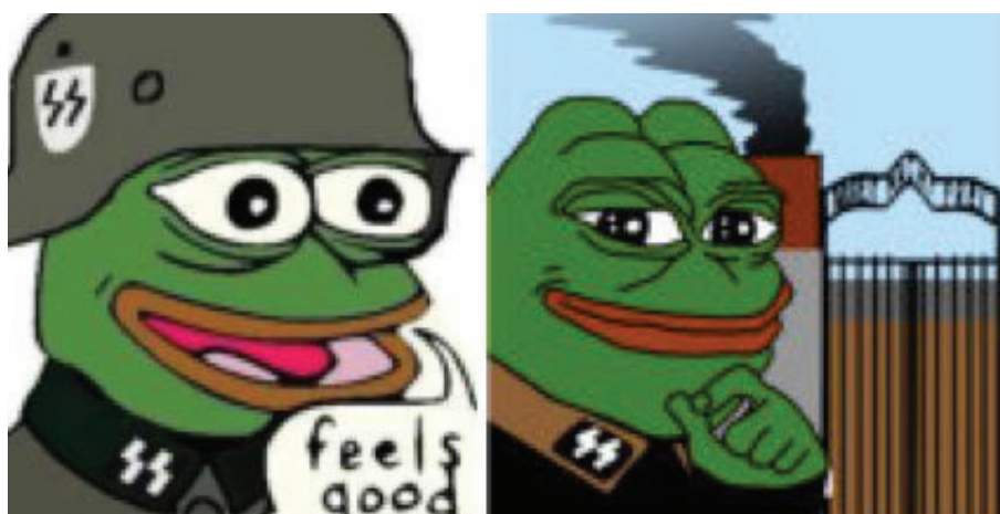
Figure 1. Pepe the Frog, co-opted as a symbol of white supremacy, pictured here as a Nazi concentration camp guard.

Optimists see the ability of memes to offer a parallel and often critical discourse to mainstream media and public discussion, giving voice to more opinions (polyvocality), as beneficial for political participation and engagement in and of itself, although primarily in liberal democratic contexts. 31 Scholars studying memes beyond the United States and Western Europe have emphasized the role of memes in forming and disseminating political narratives that oppose