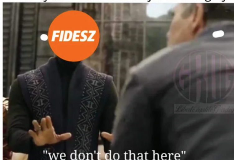
Figure 7. 'When you want "free press" in Hungary'.