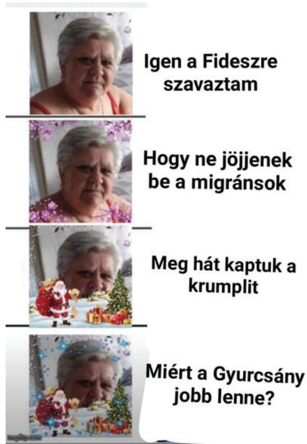
Figure 6. "Yes, I voted for Fidesz" "To prevent migrants from coming in" "So we got the potato" "Why would Gyurcsány do a better job?".