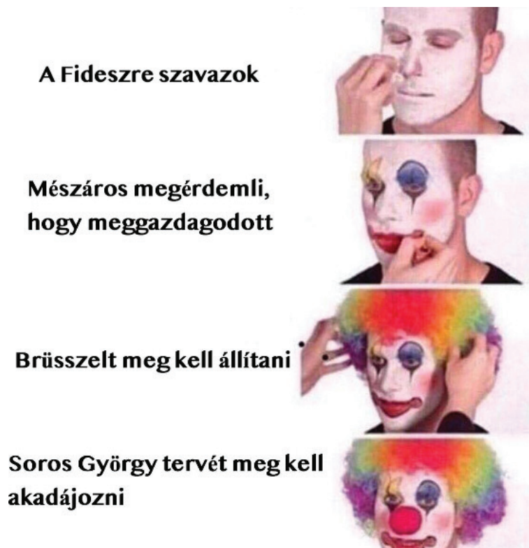
Figure 5. "I am voting for Fidesz" - "Mészáros deserves to be rich" - "Brussels must be stopped" - "Soros' plan must be blocked".