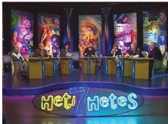
Figure 2. Reunion of popular American sitcom Friends compared to Heti Hetes.

political satire even more into the periphery of media, relegating dissidence more so to the internet and the new mass media of internet memes. 83 Other scholars agree, and point to the democratic degradation of Hungarian politics as a catalyst for shaping a distinct environment in which resistance, social activism, and overall criticism increasingly manifest online. 84 This does not necessarily counter the new media structure of concentrated power, or mean that such resistance and criticism are wholly absent from all mainstream media. But, political critiques through memes on social media offer an important capacity to disrupt mainstream narratives and contribute to sustaining a resistant counter-public in Hungary. 85