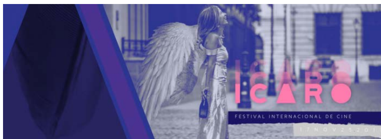
Fig. 1: Ícaro International Film Festival 2017.