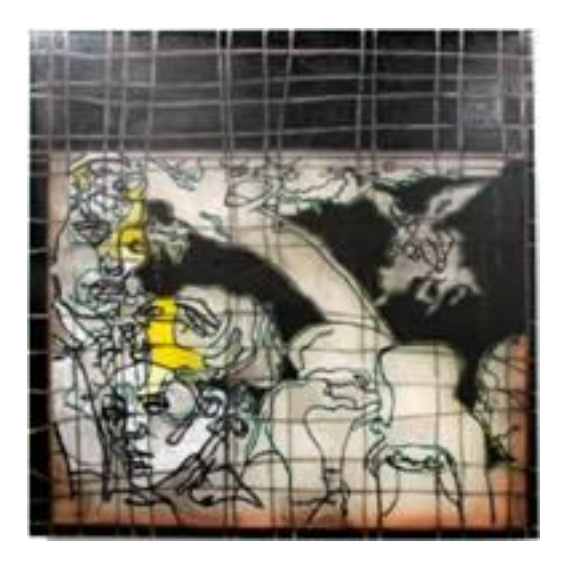
Fig. 6 Antigone, Ismene and the chorus, 2008, oil on polycarbonate.

Leroi-Gourhan saw ideologically pertinent entities in figurative superimposition. I see examples of a psychology that can produce and recognise mimetic, metaphoric and metamorphic expression.