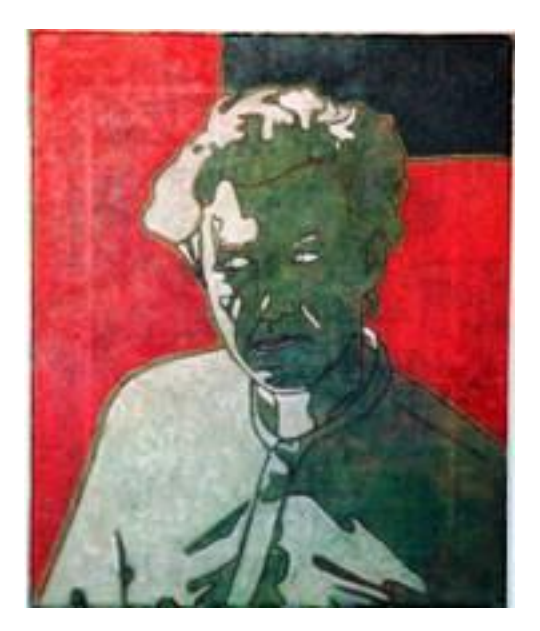
Fig. 3 Godwin as Cronus, 2005, oil on canvas.

A portrait of a man (Cronus) who only realises his idiotic adherence to rules and control when it is too late.