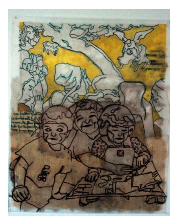
Fig. 4 Brothers (Etiocles, Polynicis and Antigone), 2005, oil on polycarbonate

black (the cosmos) and space as white (the void). This colour dichotomy in Attic black-figure pottery demonstrates a philosophical concept regarding what Laporte describes as Pythagoras's »consistent concept of opposites[:] the Limit and the Unlimited, and Light and Darkness« (LAPORTE 1947: 148). Attic vase painting, through form and colour, rather than through content/subject depicts space and form, chaos and order, void and cosmos: dichotomies inherent in dialectics. In Attic theatre, according to Nietzsche, both technique and narrative were used to express a paradigm for creativity and existence, namely a chaos-and-order duality.