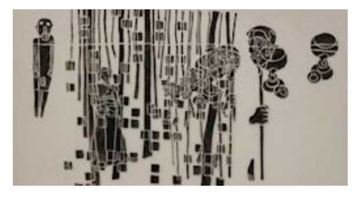
Fig. 7 Oedipus Rex, 2009, Oil on polycarbonate.

By describing the two derivatives of chaos, the accident and disturbance, as intrinsic properties of living things, Castoriadis highlights chance and deformation as intrinsic to the process of evolution. My painting practice retained a black as form, figuration, order and cosmos, with white as space, the void, chaos and the source of creation. However, two aspects of my paintings deviate from the depiction of a rigid oppositional dichotomy of space and form, black and white.