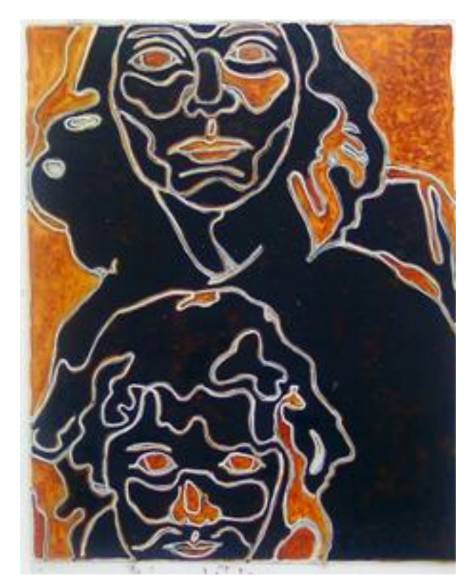
Fig. 2 Jocasta and Antigone, 2007, oil on polycarbonate.

The woman is Jocasta, a mother capable of killing her own child. The girl is Antigone, who sacrifices her own life for the love of her brother. They are both strong women.