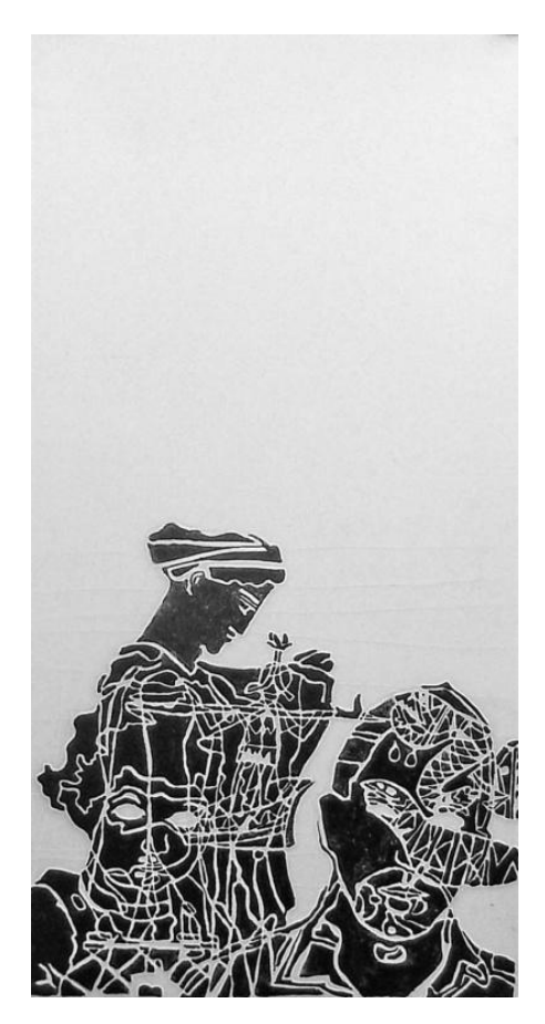
Fig. 1 Human Nature, 2009, Oil on Polycarbonate.

Human Nature displays the male and female psyche described by the Ancient Greeks. The young girl (Antigone) is connected to the Ancient Greek image of a young woman and to the male figure who is Oedipus, her father. The male figure is connected to Paul Klee's sea monsters (chaos) as well as the human figure that is slaying them (order).