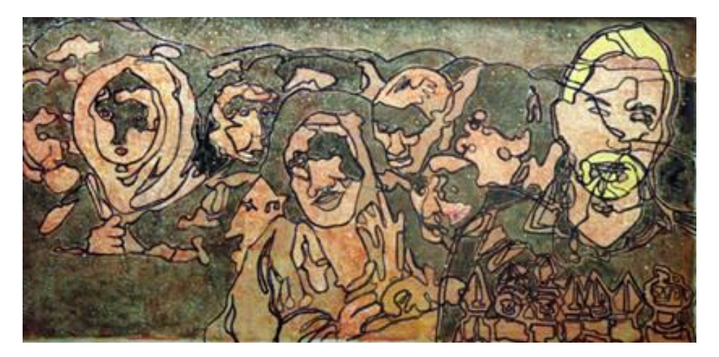
Fig. 8 The chorus sing, 2005, oil on polycarbonate.

The chorus, here borrowed from Francisco Goya's Witches Sabbath , represents society in all its aspects (>the imaginary institution of society<). The male is Oedipus, who stands apart from the chorus (society) but is also connected to them. This is a form of visual philosophical enquiry regarding existence within the cosmos. >Entities< and >multiplicity<, >being< and >becoming<.