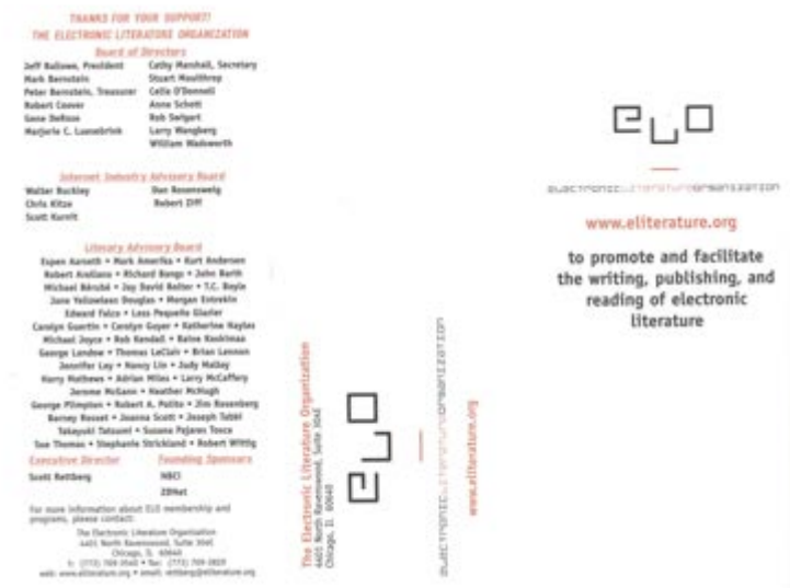
The ELO's first membership brochure (2000).

In retrospect it is almost staggering that we were able to pull together so many influential people in so brief a period. The first board of directors was very productive