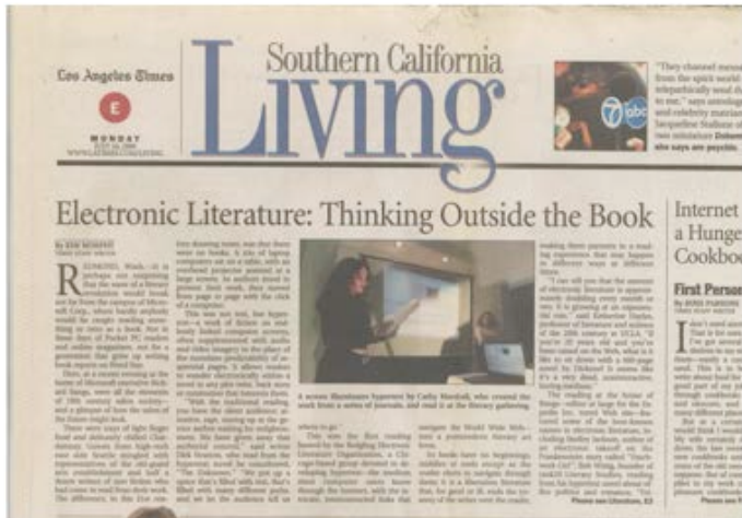
Article about electronic literature in the Los Angeles Times, July 24, 2000, based on interviews conducted after the ELO fundraising event in Seattle.