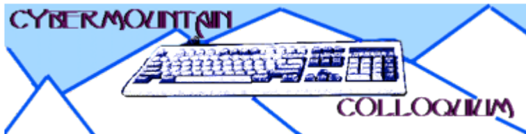
Banner for the Cybermountain Colloquium website.