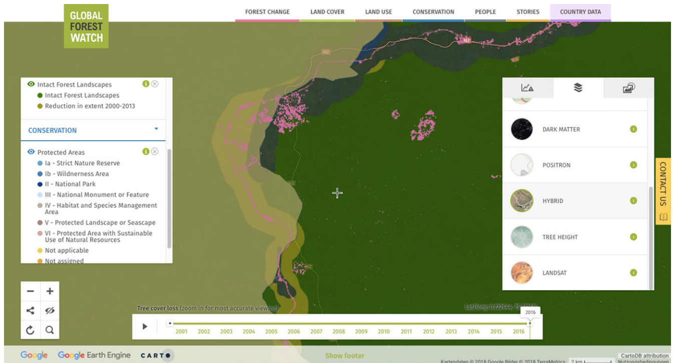
FIGURE 2 Screen-capture of Global Forest Watch in a region of the Republic of Congo with “GLAD Alerts” and “Preservation Areas” layers turned on; notice the incommensurability where deforestation (pale dots) is reported inside the boundaries of the Preserve (dark polygons).

Global Forest Watch retains some of the features of zoom-tool visualizations that we have identified as rhetorically and politically problematic: namely, it presents the move from global to local smoothly, as a synecdochic process of focusing a lens rather than a series of metaphorical comparisons among images of various qualities, sources, and time-stamps. It also imposes algorithms for remote-sensing forest coverage that at times disagree with local histories and even naked-eye observations of new plantations (Müller, 2017).